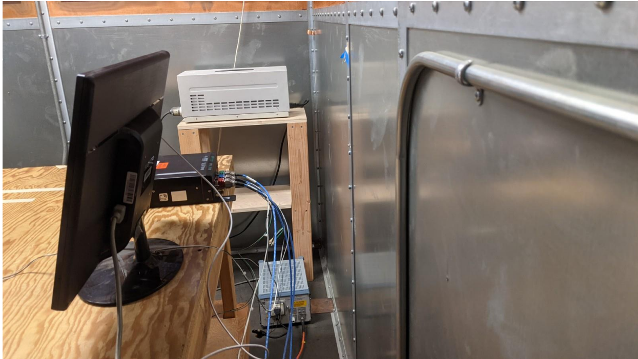
AC Wireline Side