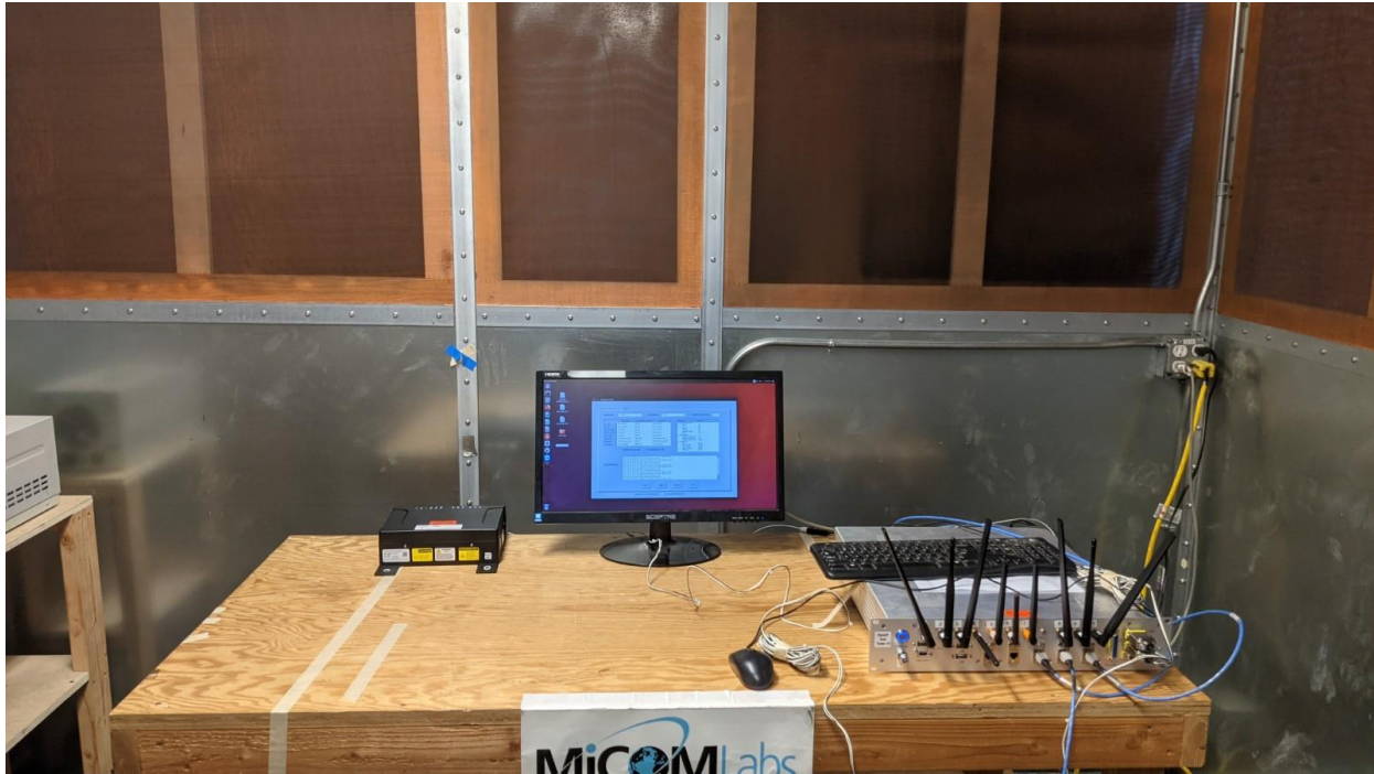
AC Wireline Front