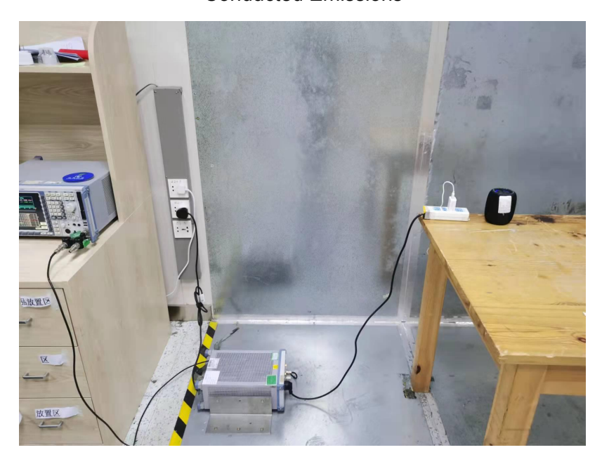
Radiated Emissions From 30M-1GHz