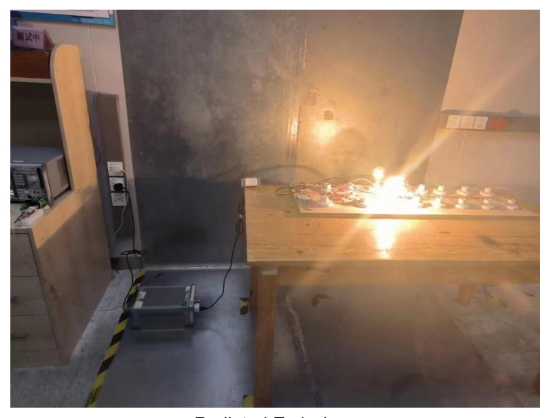
Radiated Emissions From 30MHz-1000MHz