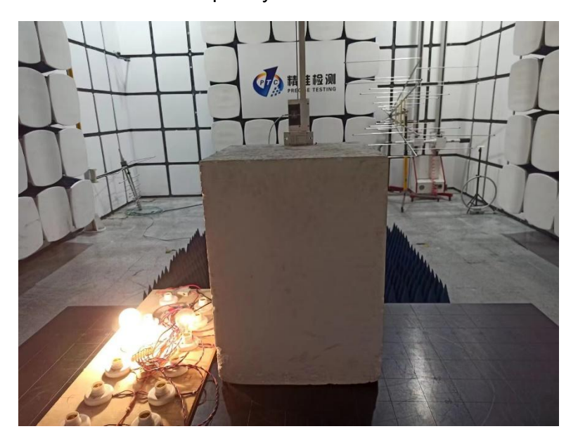
Test frequency from Above 1GHz