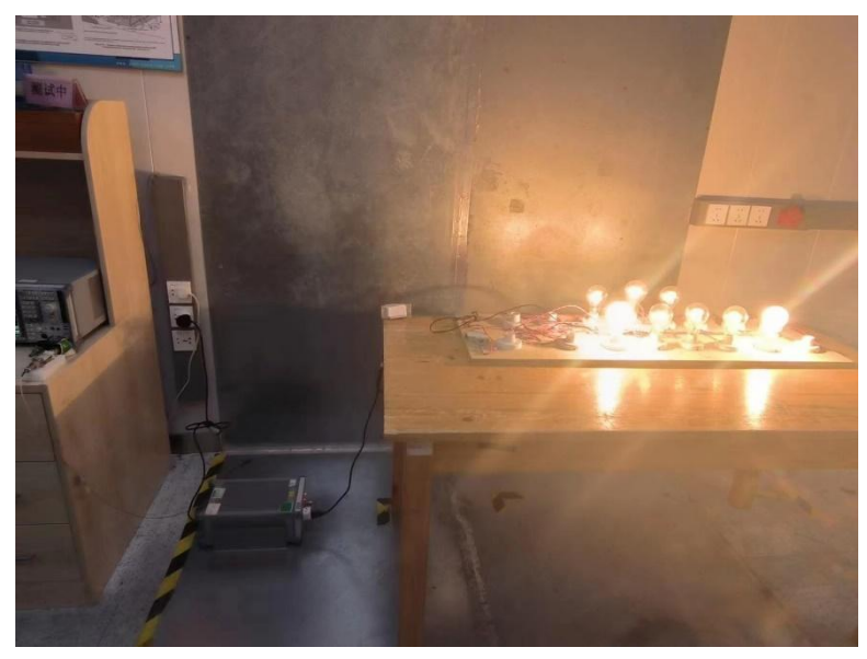
Radiated Emissions From 30MHz-1000MHz