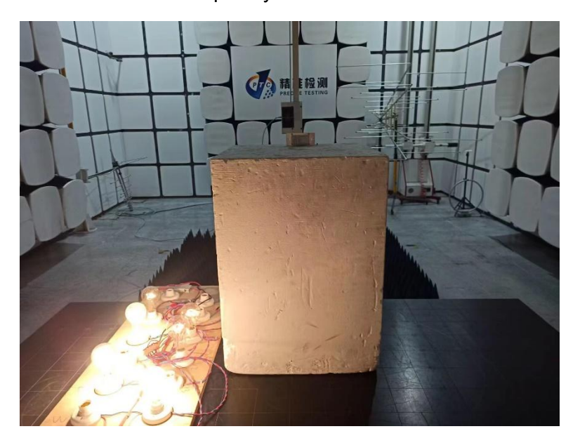
Test frequency from Above 1GHz