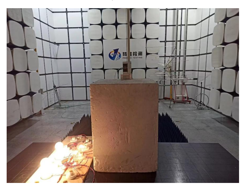
Test frequency from Above 1GHz