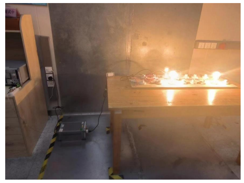
Radiated Emissions From 30MHz-1000MHz