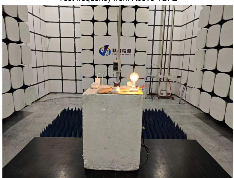
Test frequency from Above 1GHz