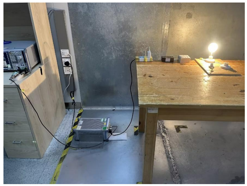
Radiated Spurious Emissions Test Frequency From Below 30MHz