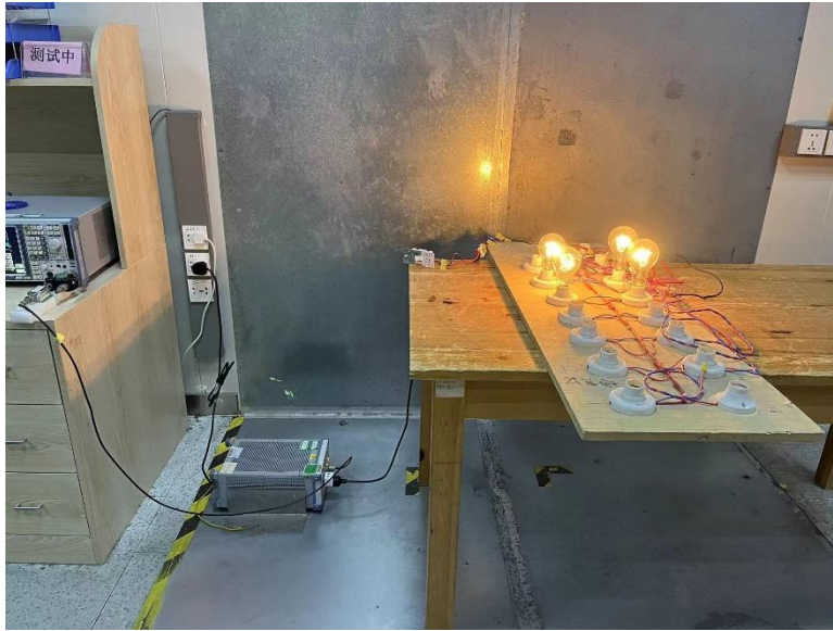
Radiated Spurious Emissions Test Frequency From Below 30MHz