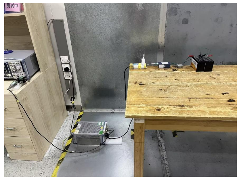
Radiated Spurious Emissions Test Frequency From Below 30MHz