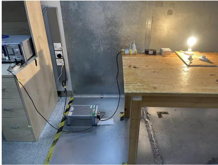
Radiated Spurious Emissions Test Frequency From Below 30MHz