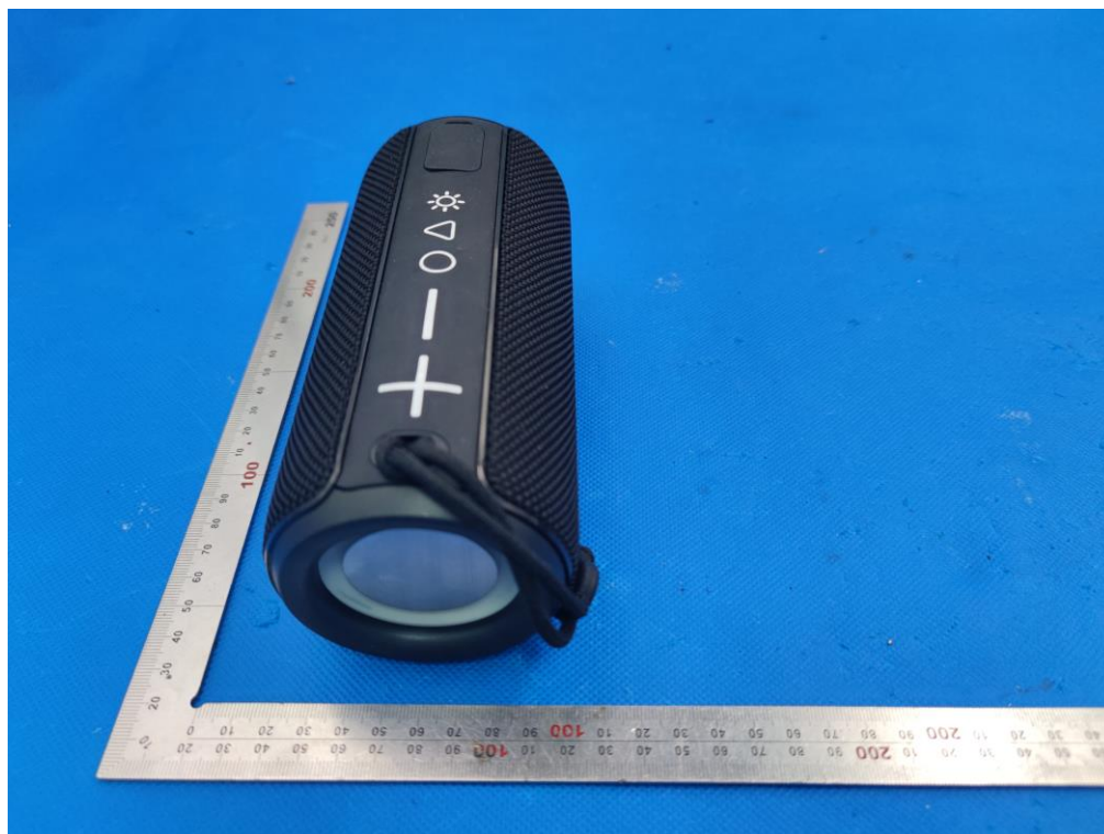
PORT VIEW OF EUT