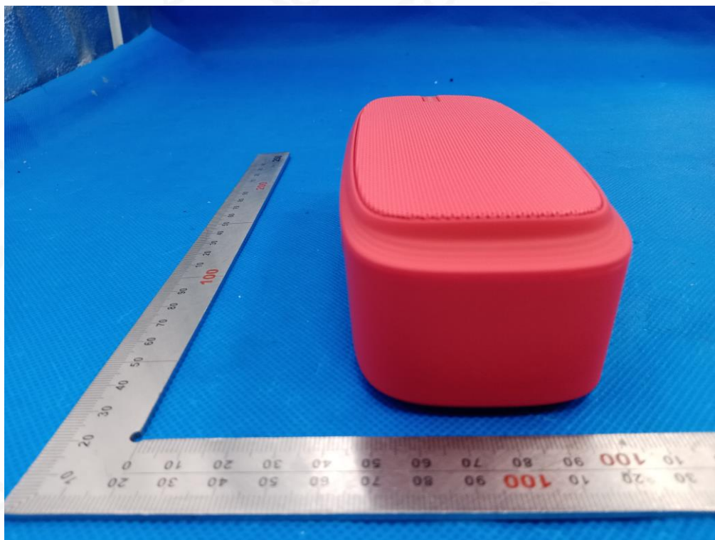
PORT VIEW OF EUT