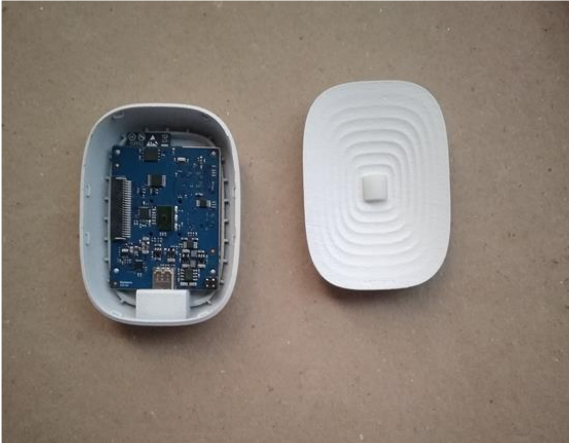
Photograph No.1 130H-Plus / 131H-Plus PCB Internal view