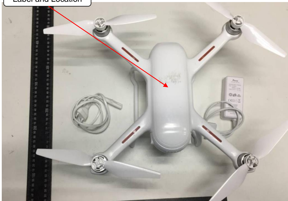
Label and Location