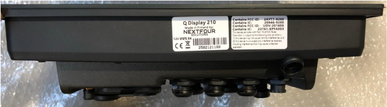
Figure 2 Device external label location, bottom edge next to manufacturer label