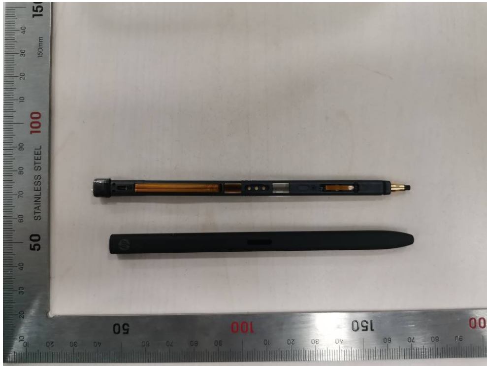
Fig.1 Internal view-01