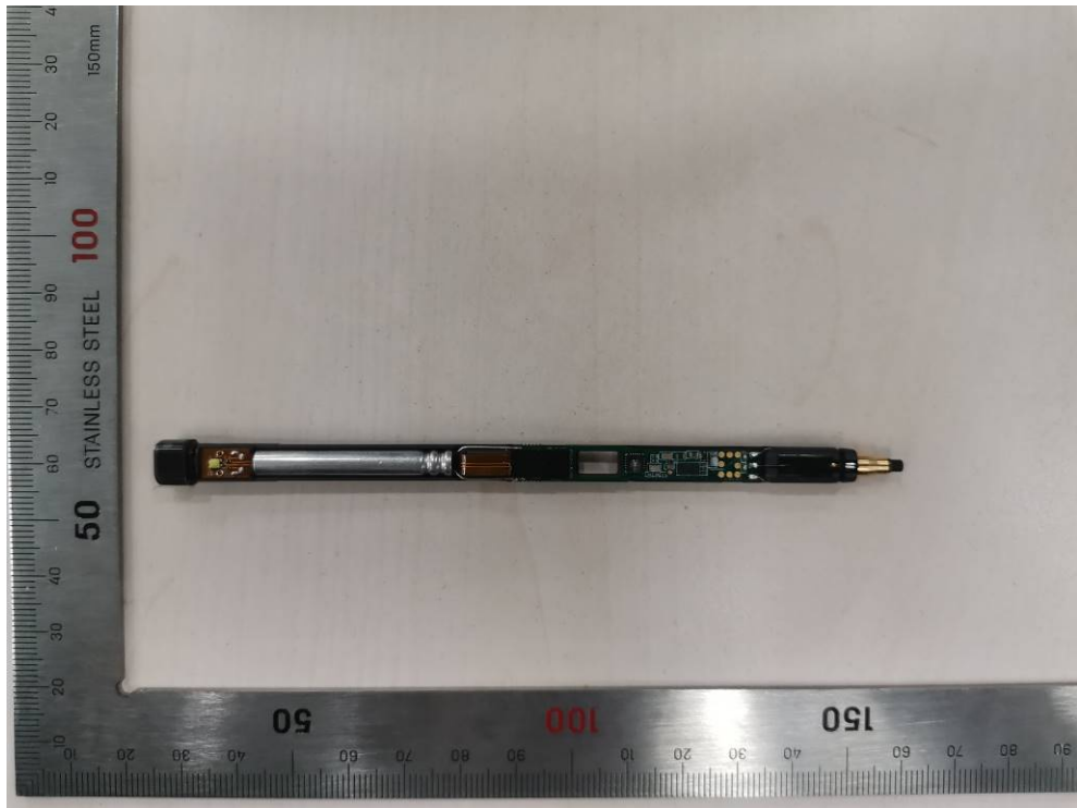
Fig.2 Internal view-02