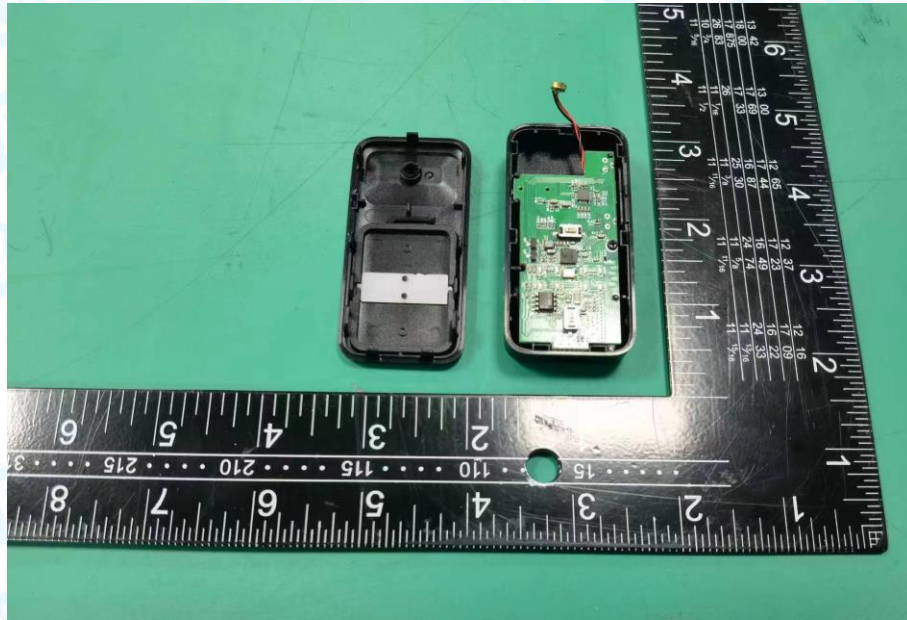
Photo 8 Appearance of PCB & Battery