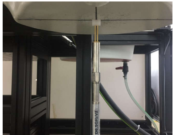
System Performance Check Setup