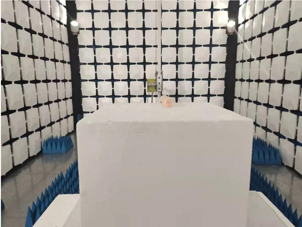
Above 1GHz for radiated emission test setup