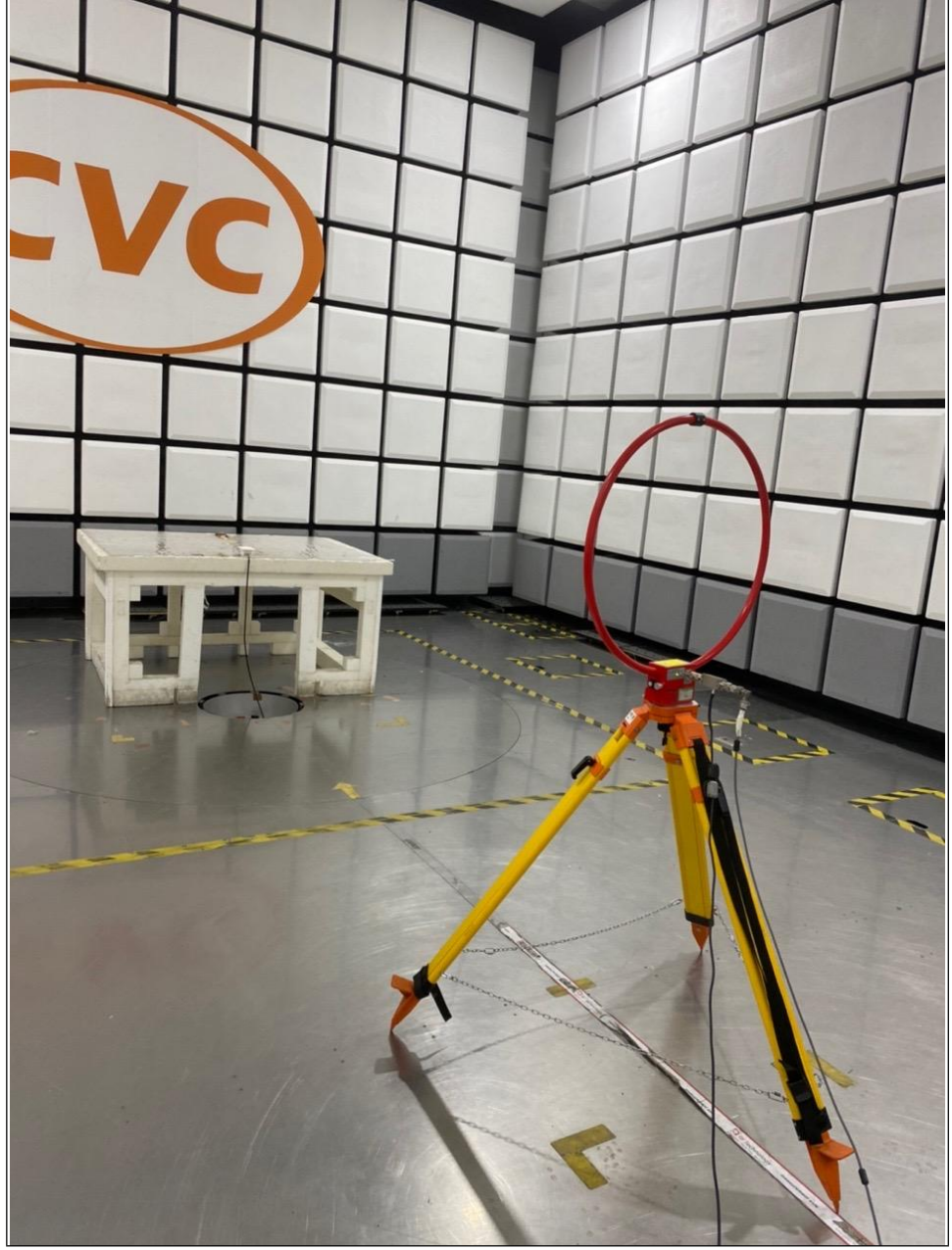
Frequency Range< 9kHz~30MHz >