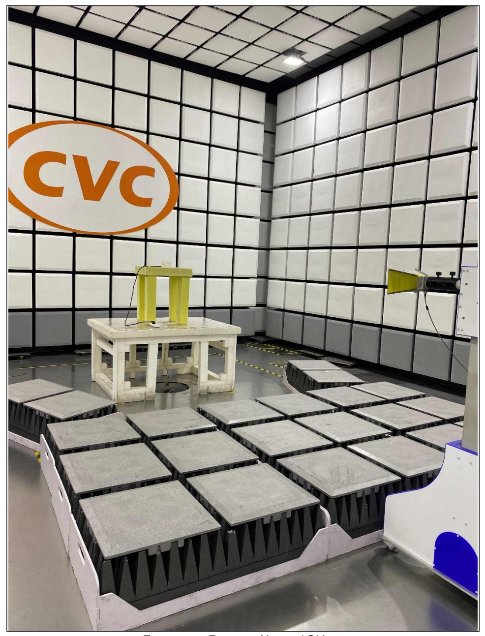
Frequency Range< Above 1GHz >