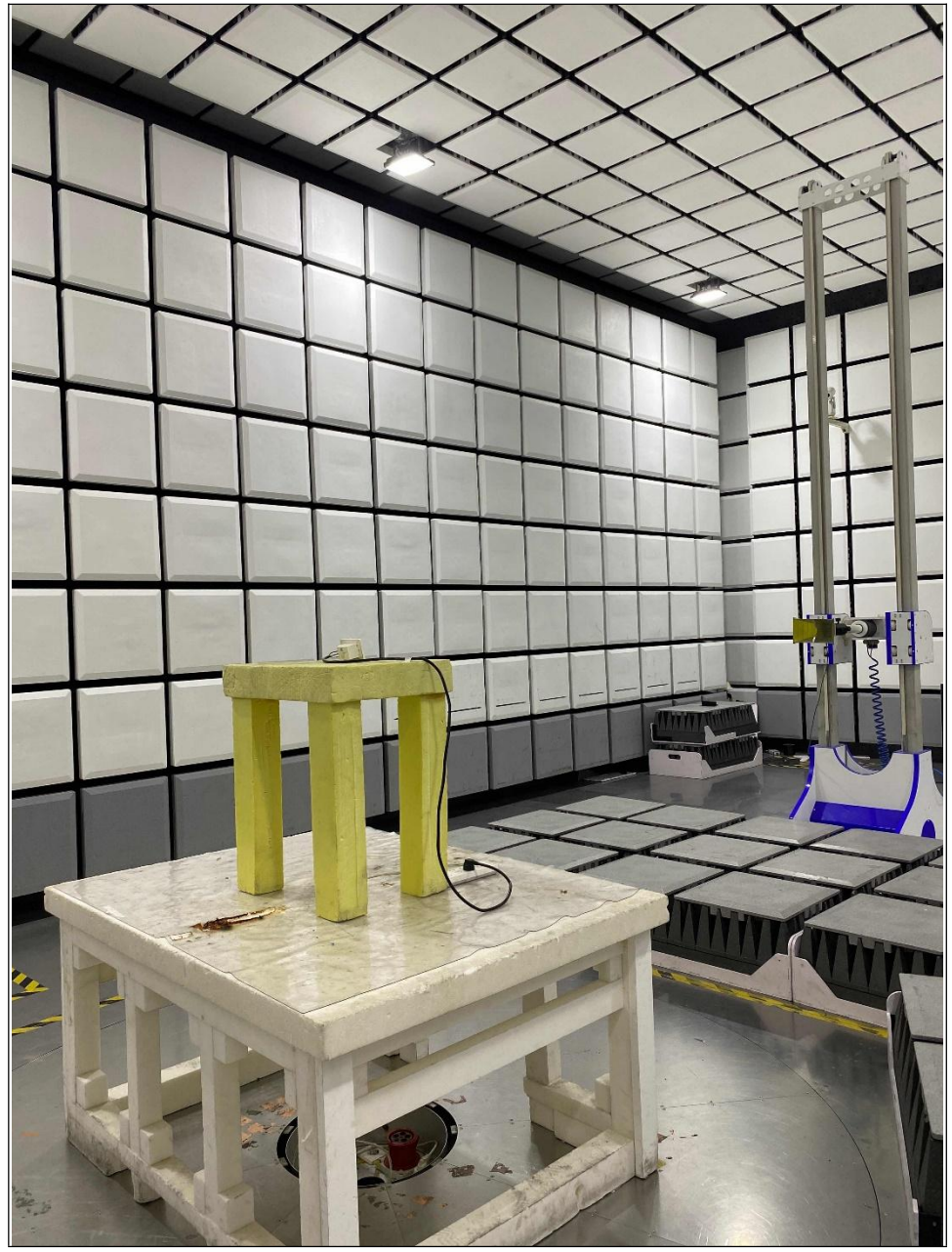
Frequency Range< Above 1GHz >