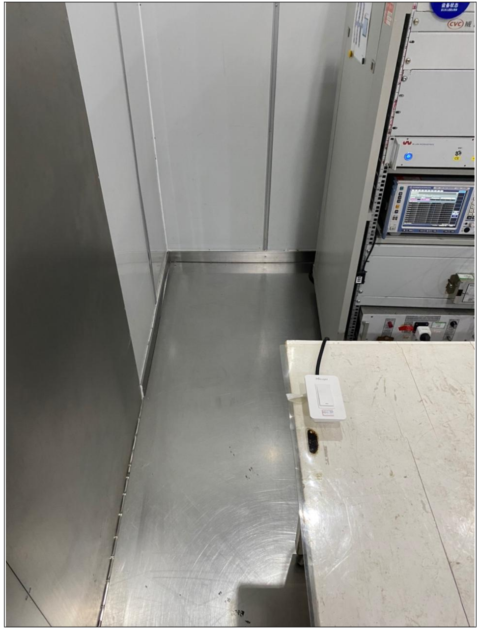
Frequency Range< 150kHz~30MHz >