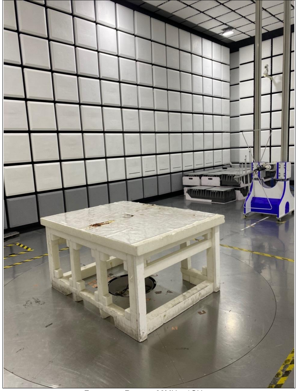
Frequency Range< 30MHz~1GHz >