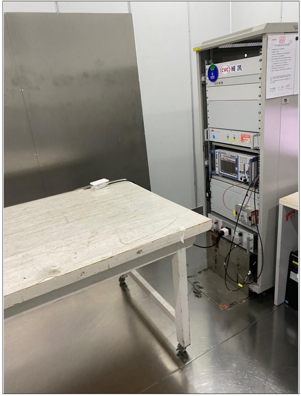
Frequency Range< 150kHz~30MHz >