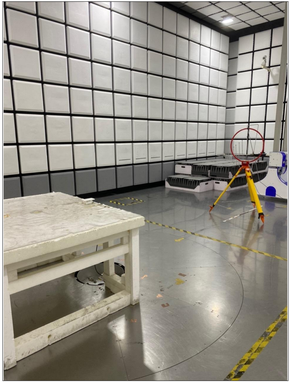
Frequency Range< 9kHz~30MHz >