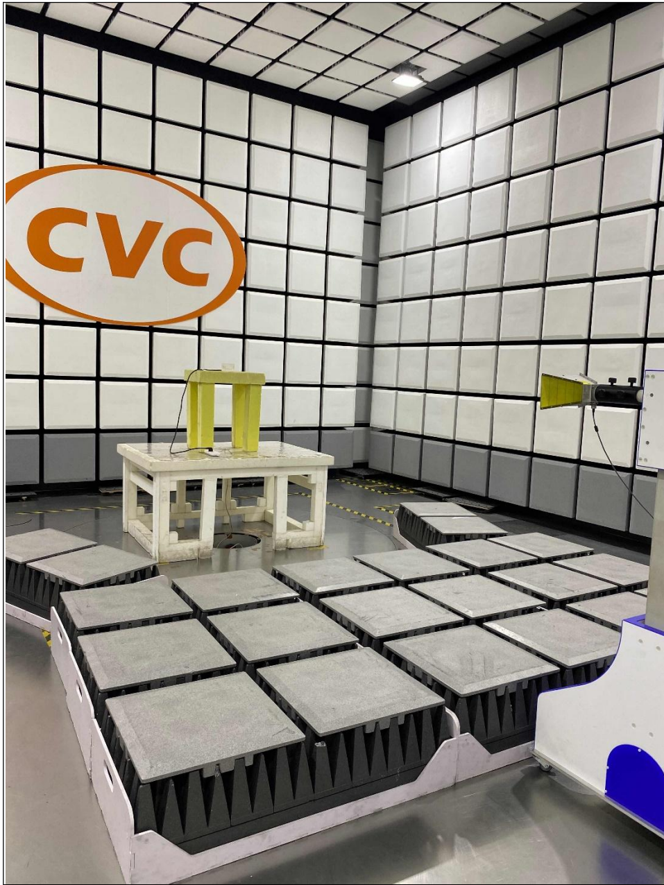
Frequency Range< Above 1GHz >