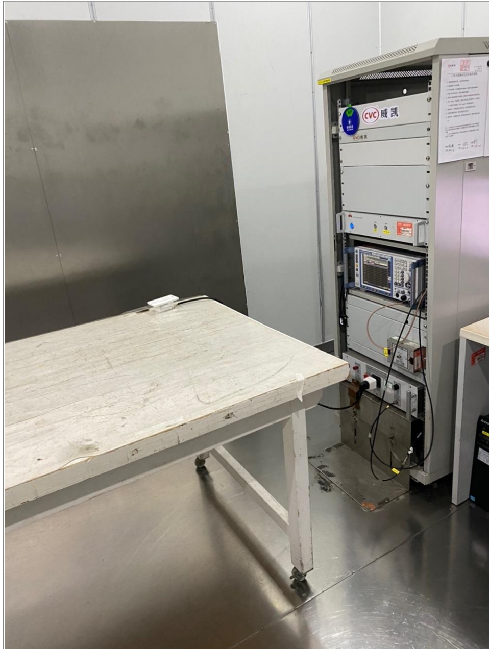
Frequency Range < 150kHz~30MHz >