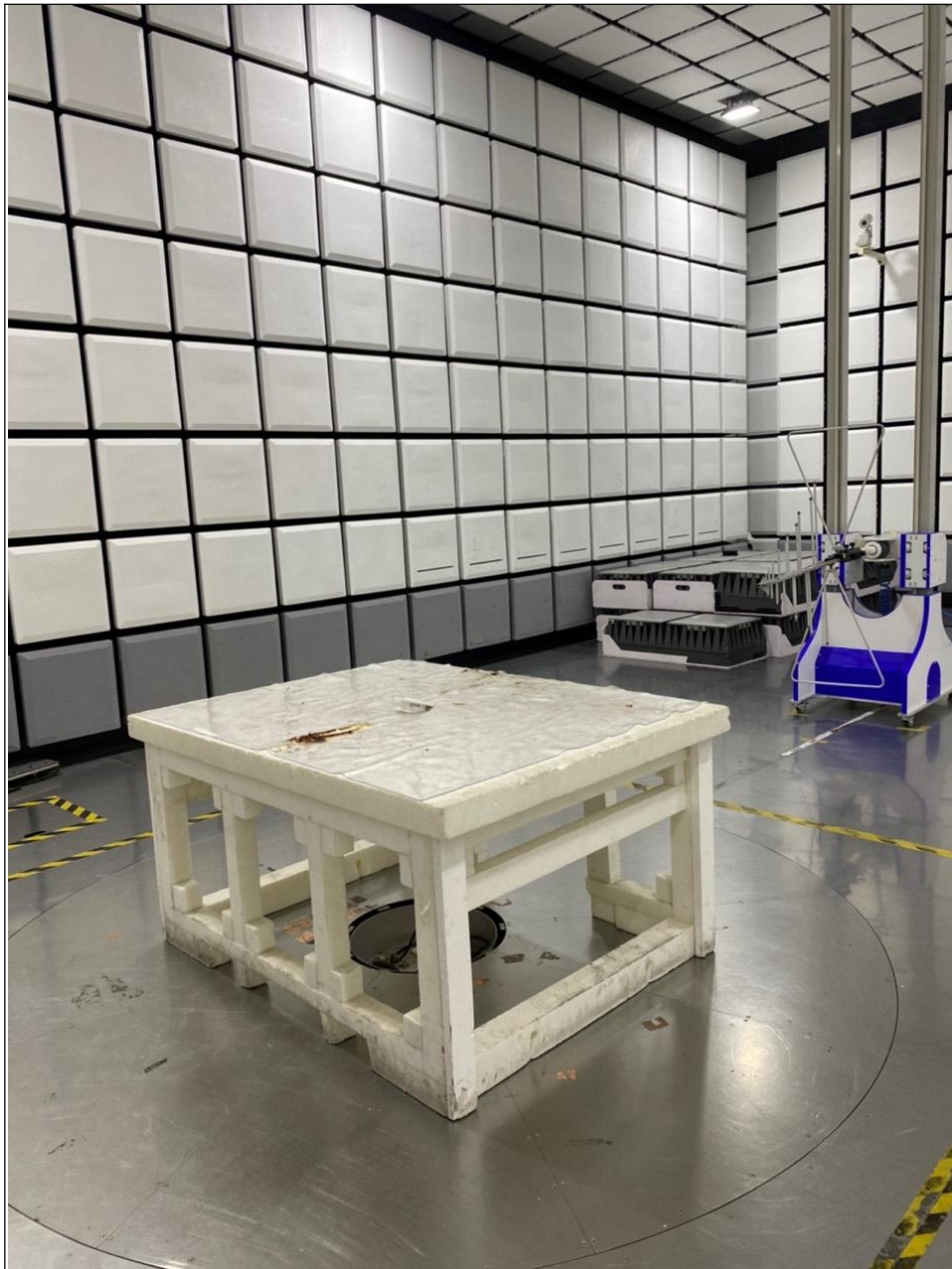
Frequency Range < 30MHz~1GHz >