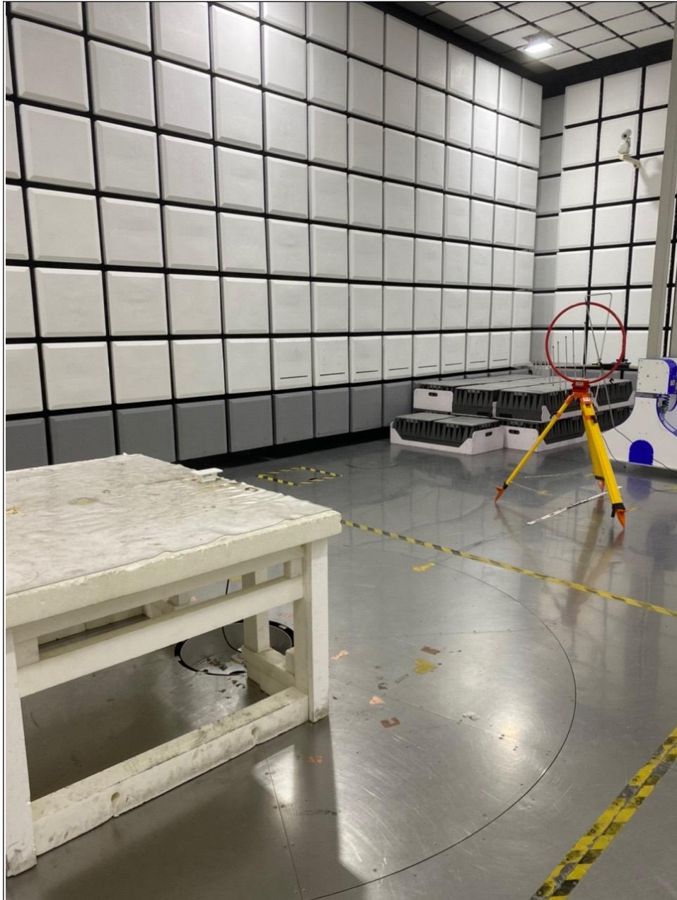
Frequency Range < 9kHz~30MHz >