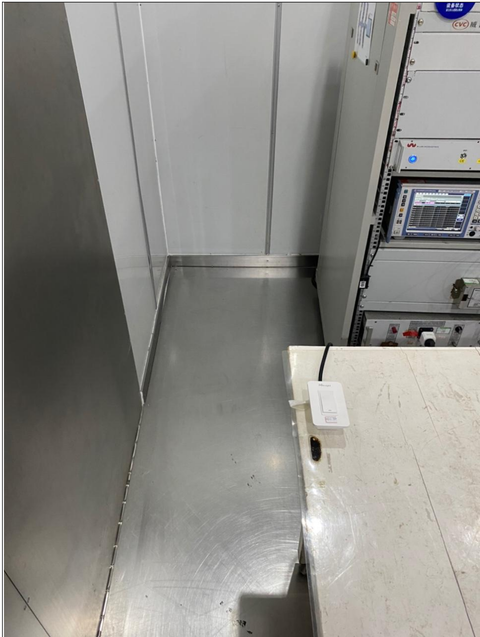
Frequency Range < 150kHz~30MHz >