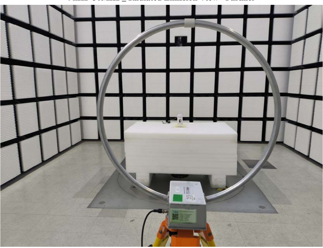
9kHz\hbox{--}30MHz \_ Radiated Emission View - Perpendicular