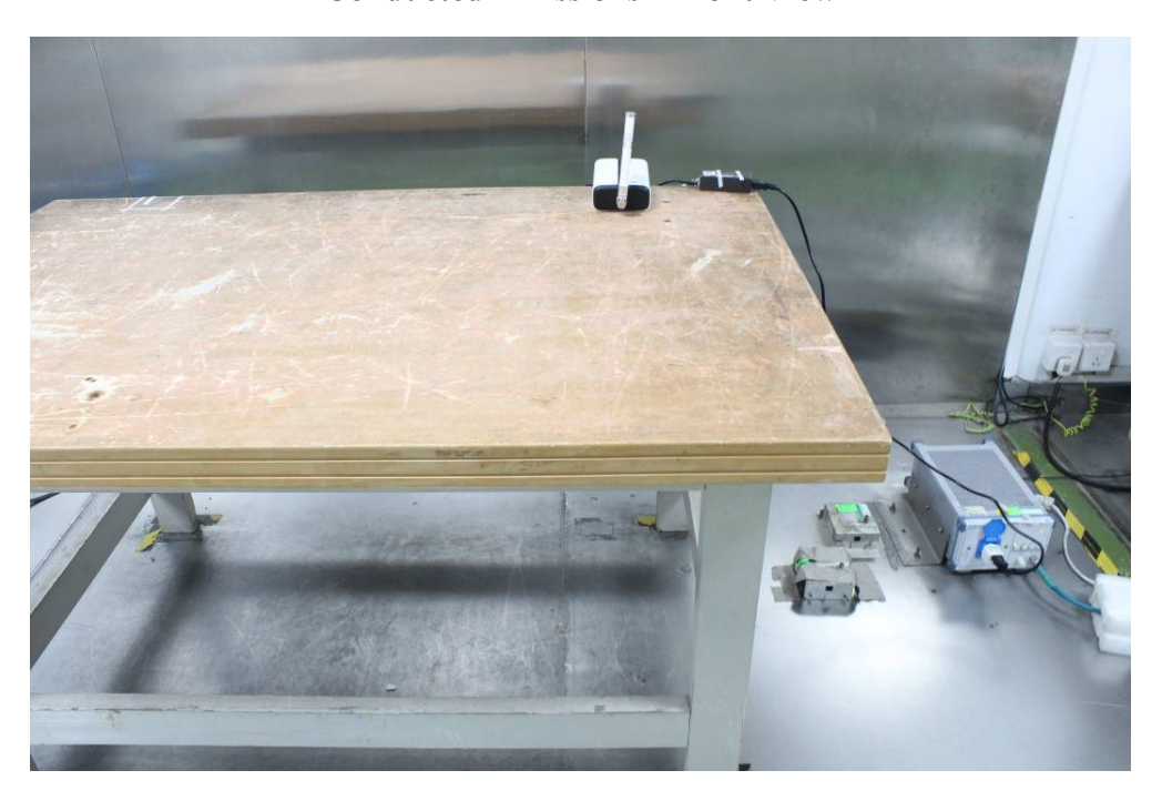
Conducted Emissions - Front View