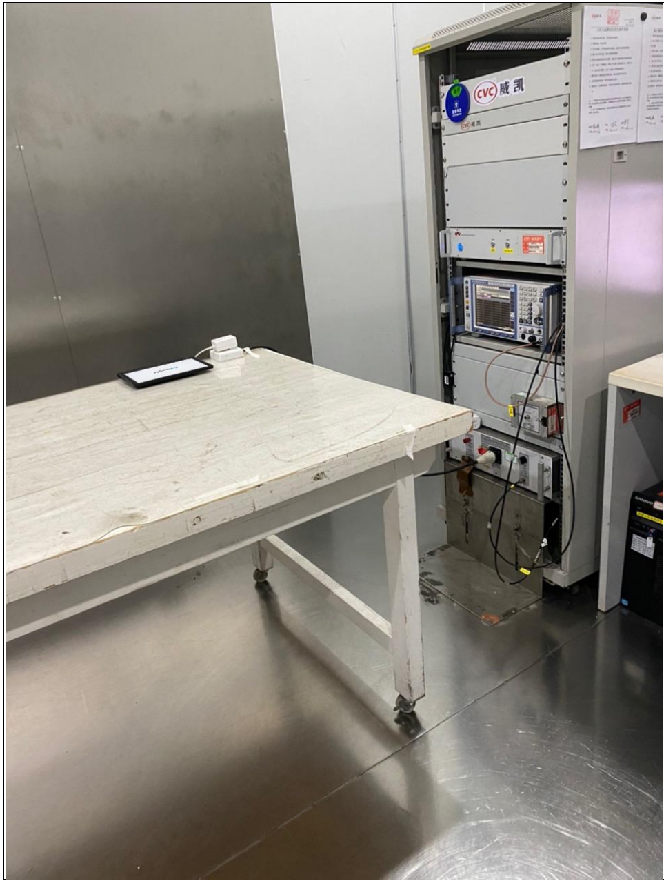
Frequency Range< 150kHz~30MHz>