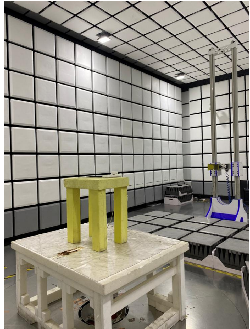
Frequency Range<Above 1GHz>