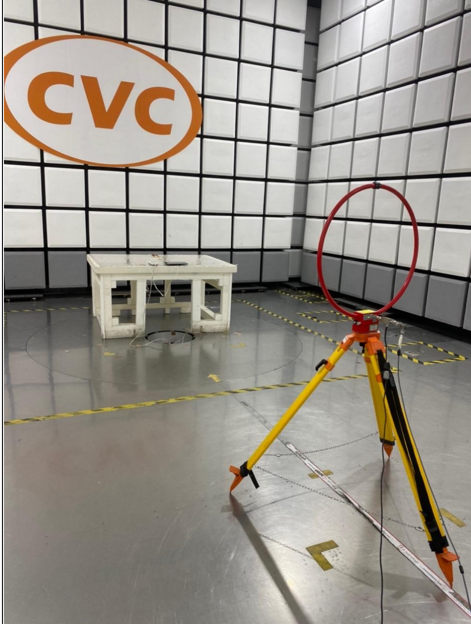
Frequency Range < 9kHz~30MHz >