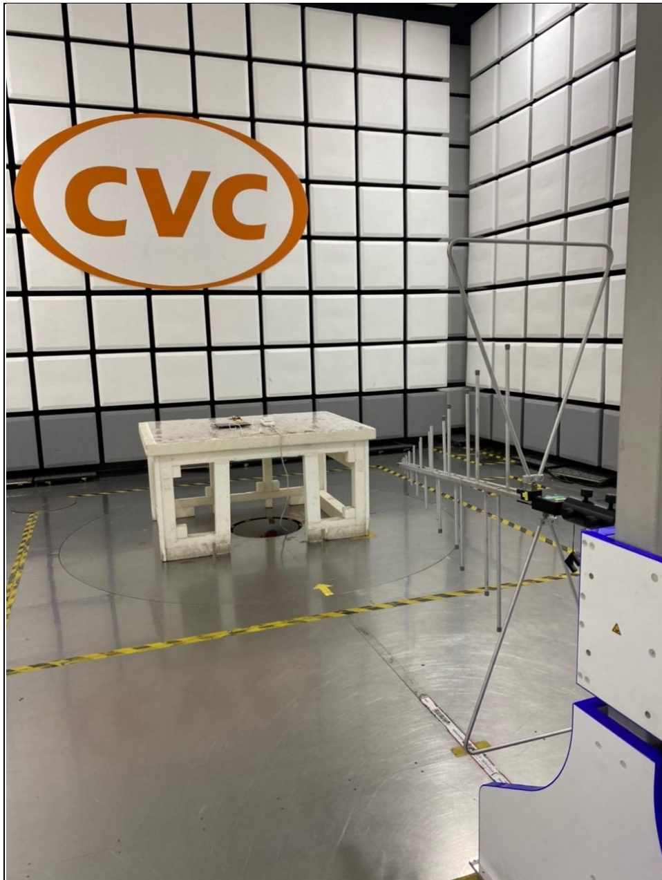
Frequency Range< 30MHz~1GHz>