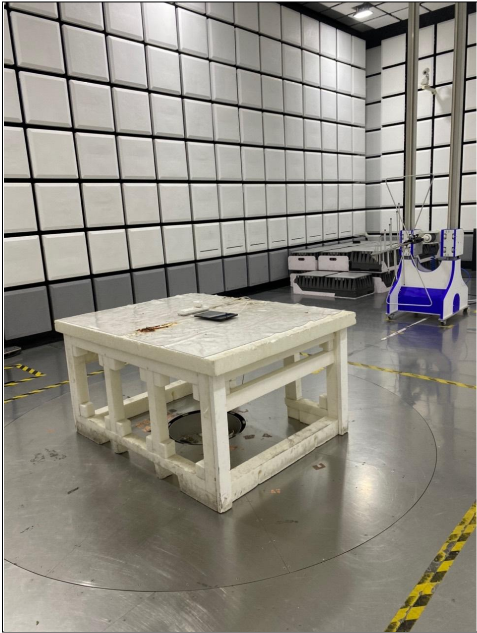
Frequency Range< 30MHz~1GHz>