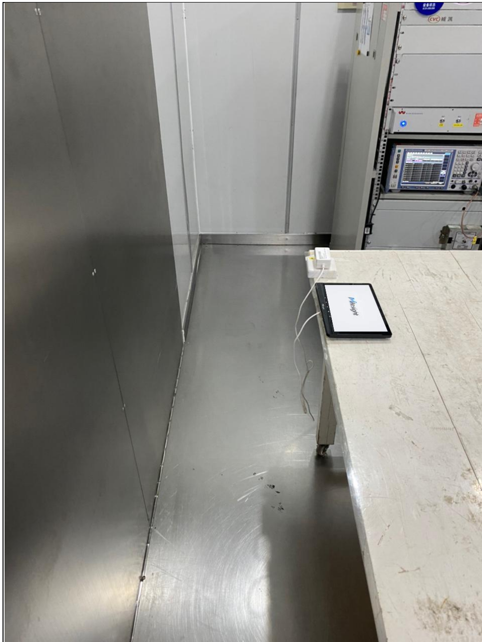
Frequency Range< 150kHz~30MHz>