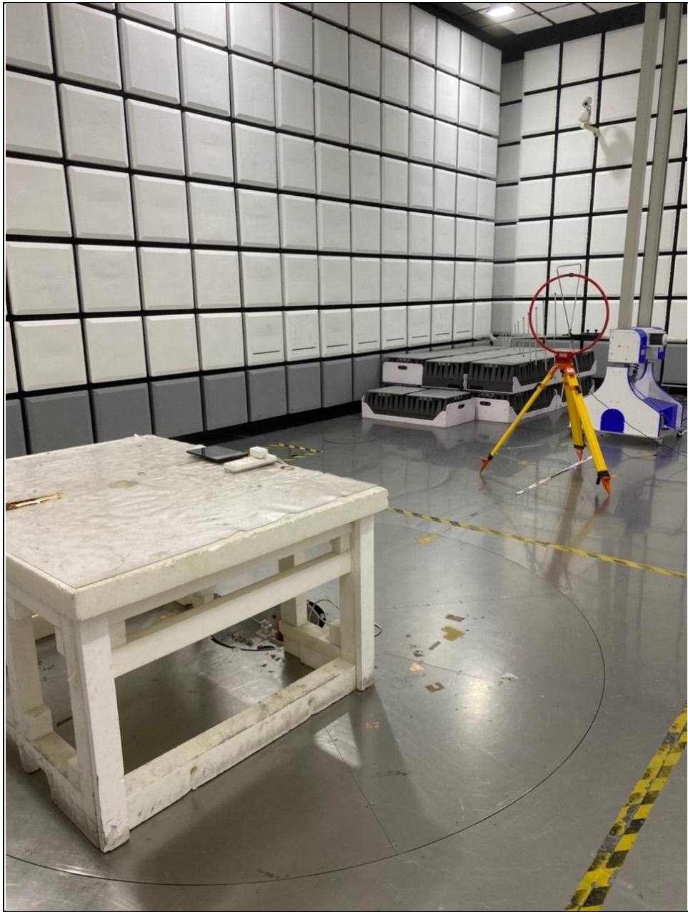
Frequency Range< 9kHz~30MHz>