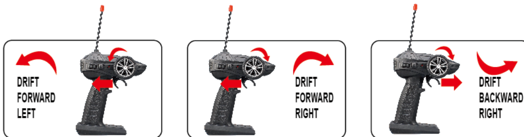
Drift Forward Left - Drift Forward Right - Drift Backward Right