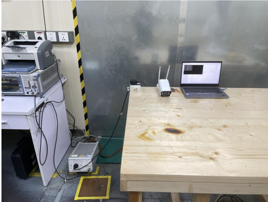
Conducted Emissions Photo