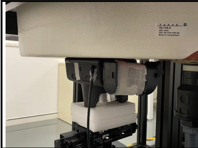
Front Face of EUT with 0 cm Gap