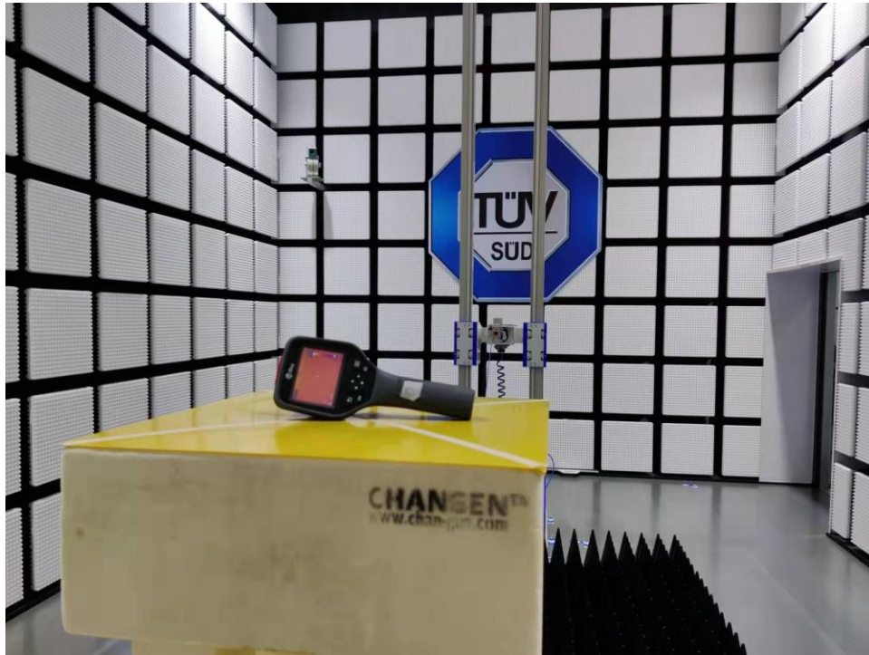
Radiated Spurious emission Above 18GHz