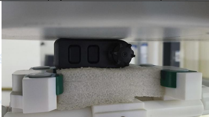
Left Side (Separation distance of 0mm)