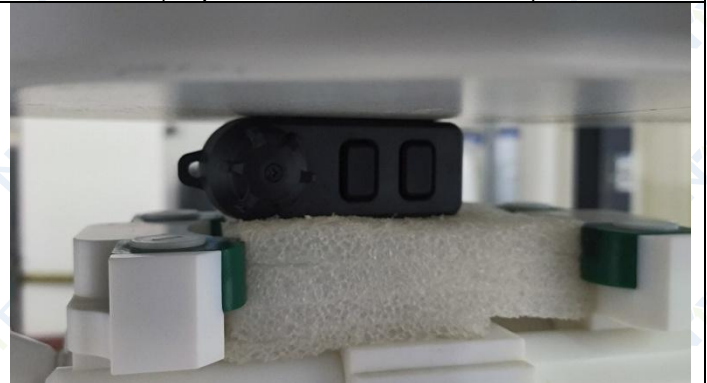
Right Side (Separation distance of 0mm)