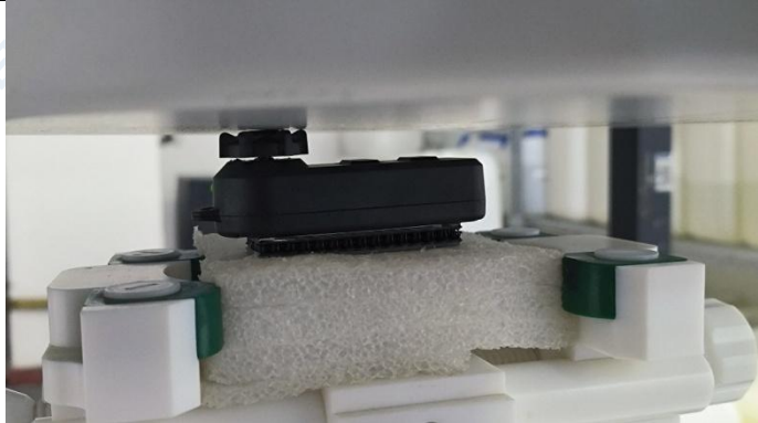
Front Side (Separation distance of 0mm)