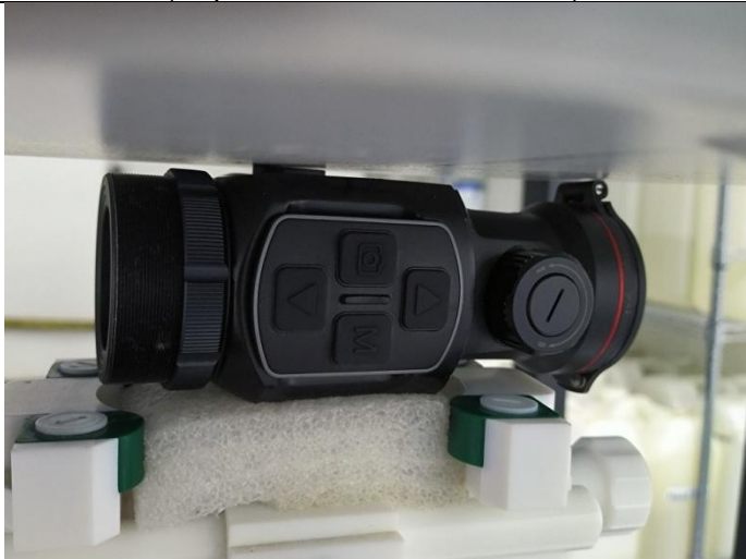
Left Side (Separation distance of 0mm)