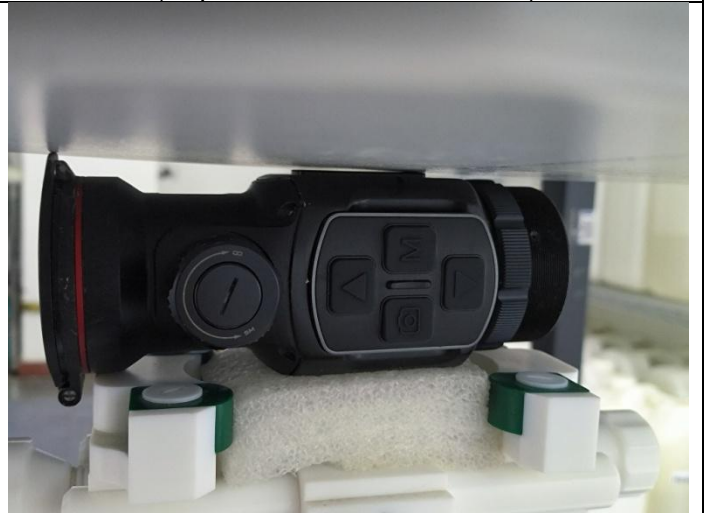
Right Side (Separation distance of 0mm)