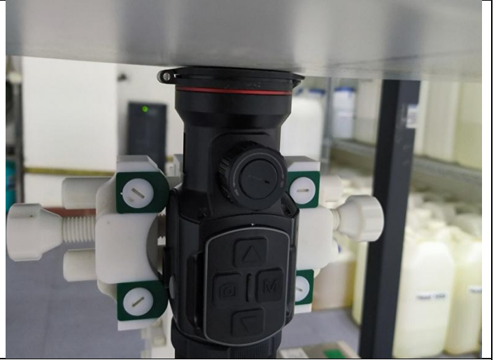
Back Side (Separation distance of 0mm)