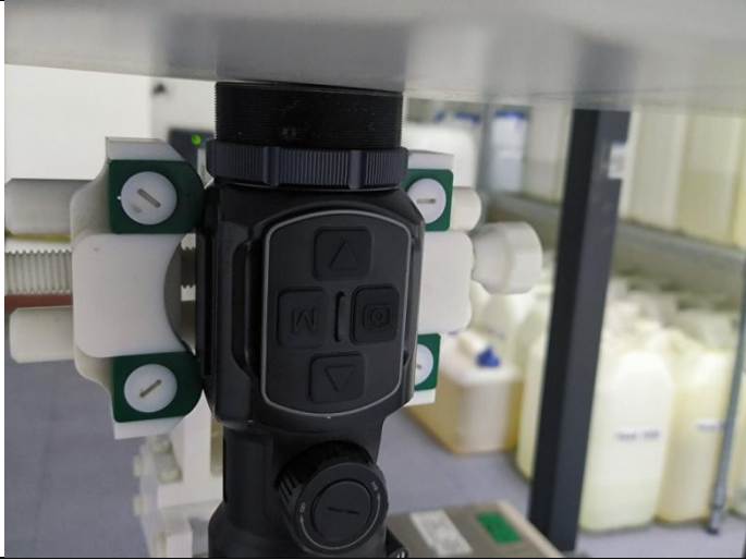
Front Side (Separation distance of 0mm)