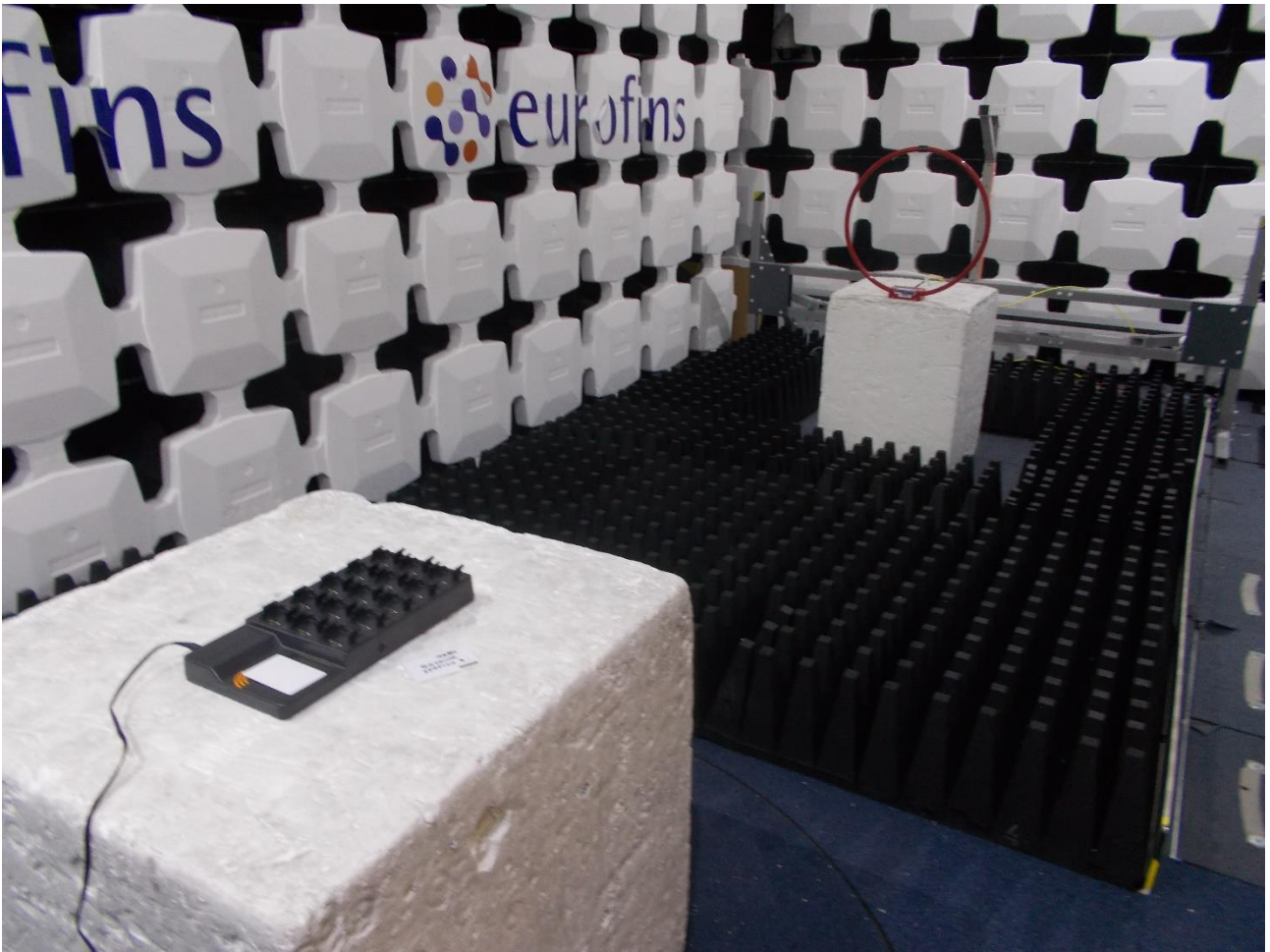
Radiated magnetic field emissions 9kHz to 30MHz – antenna parallel