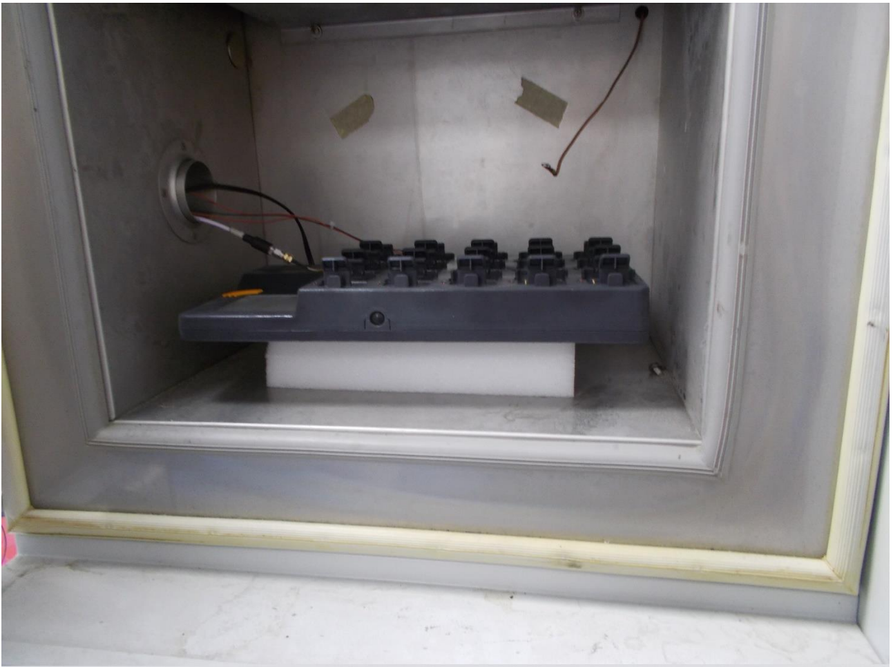
Frequency stability measurements