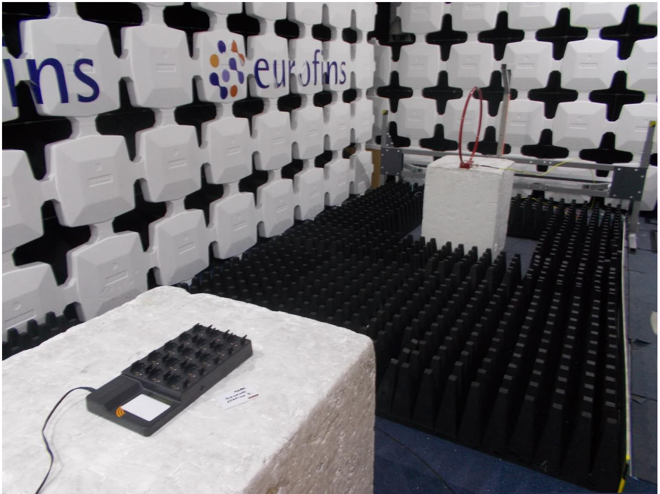
Radiated magnetic field emissions 9kHz to 30MHz – antenna perpendicular