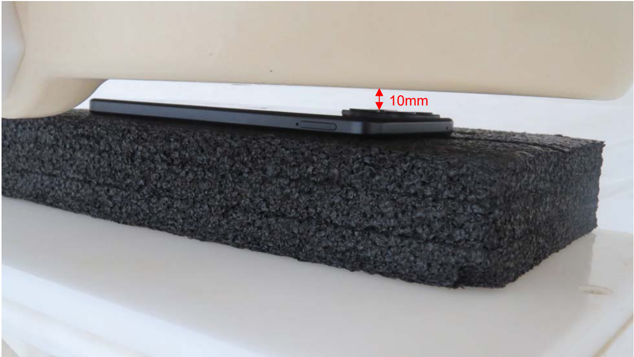
Picture 7: Back Side, the distance from handset to the bottom of the Phantom is 10mm