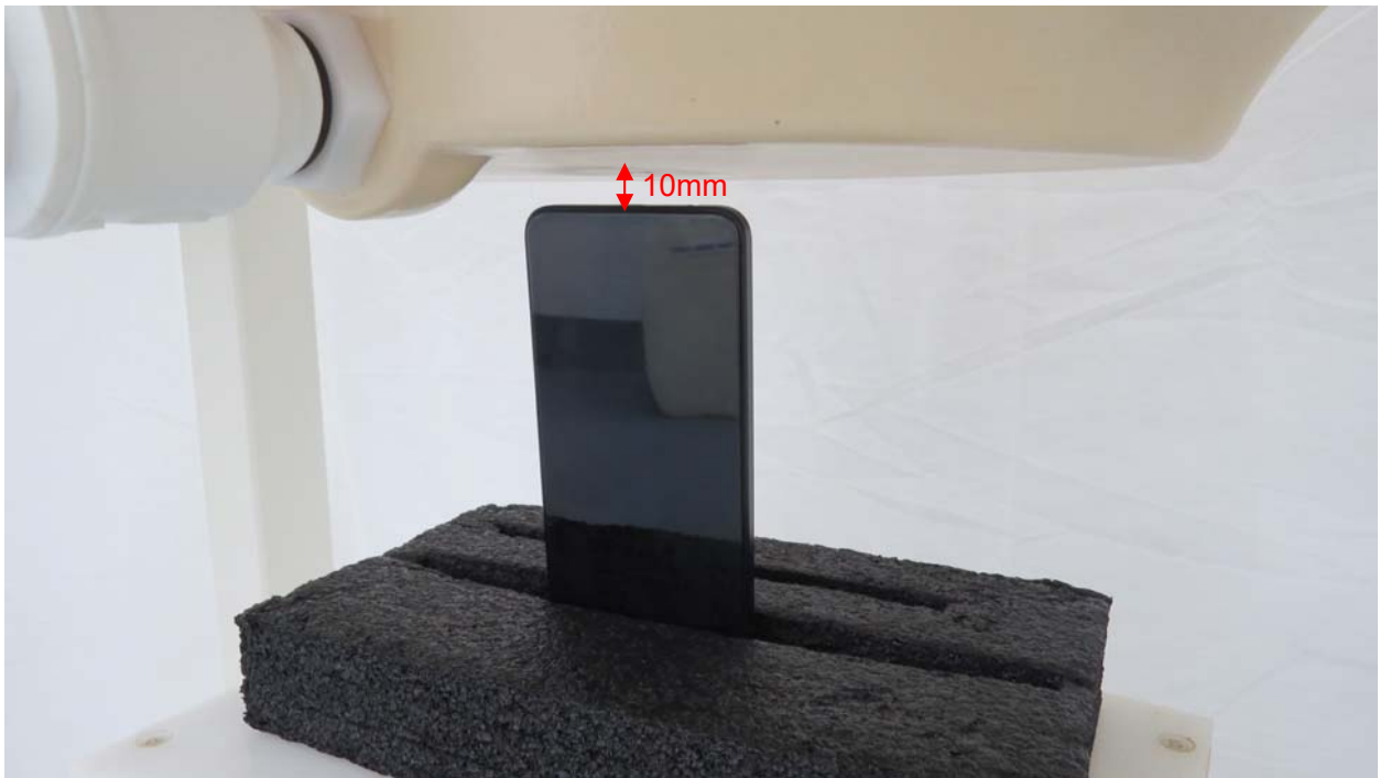
Picture 12: Bottom Edge, the distance from handset to the bottom of the Phantom is 10mm