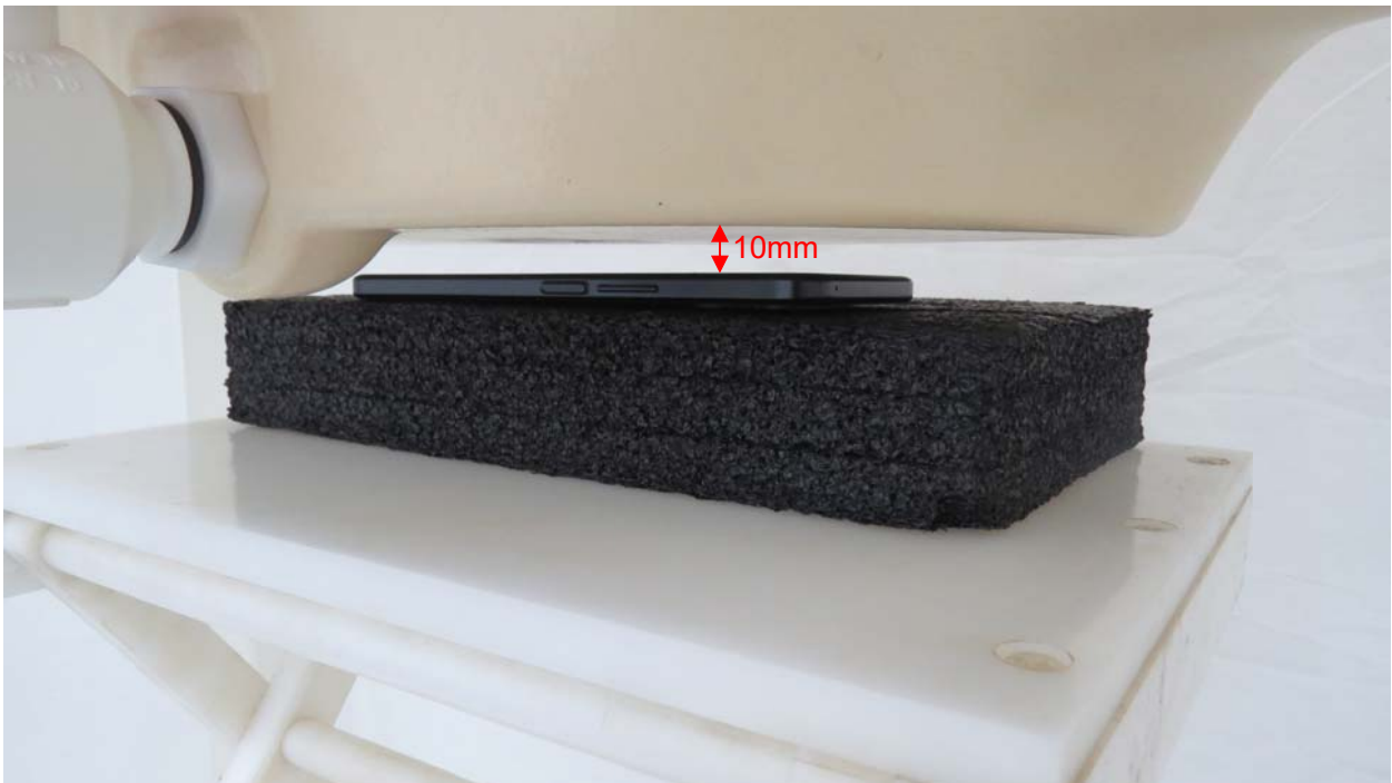
Picture 8: Front Side, the distance from handset to the bottom of the Phantom is 10mm