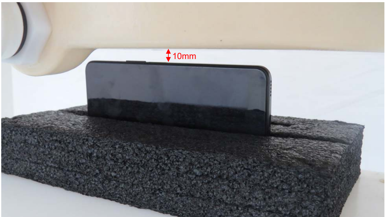
Picture 10: Right Side, the distance from handset to the bottom of the Phantom is 10mm