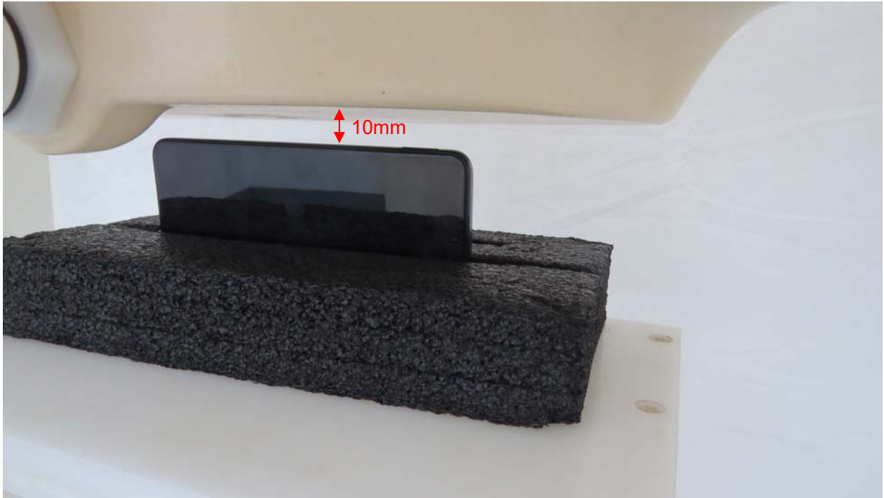
Picture 9: Left Side, the distance from handset to the bottom of the Phantom is 10mm