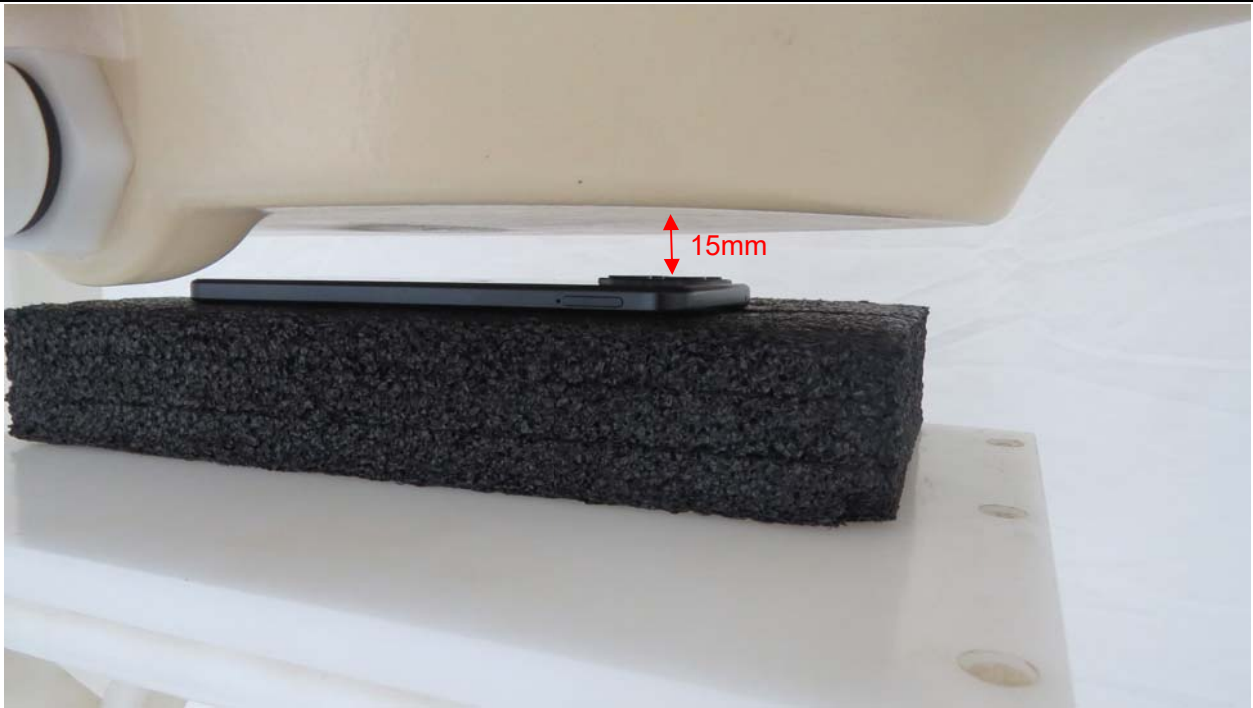
Picture 5: Back Side, the distance from handset to the bottom of the Phantom is 15mm