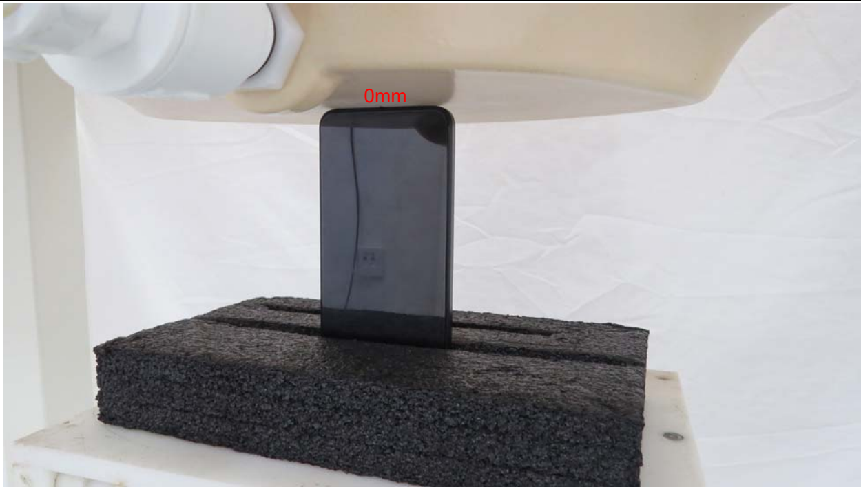
Picture 13: Bottom Edge, the distance from handset to the bottom of the Phantom is 0mm