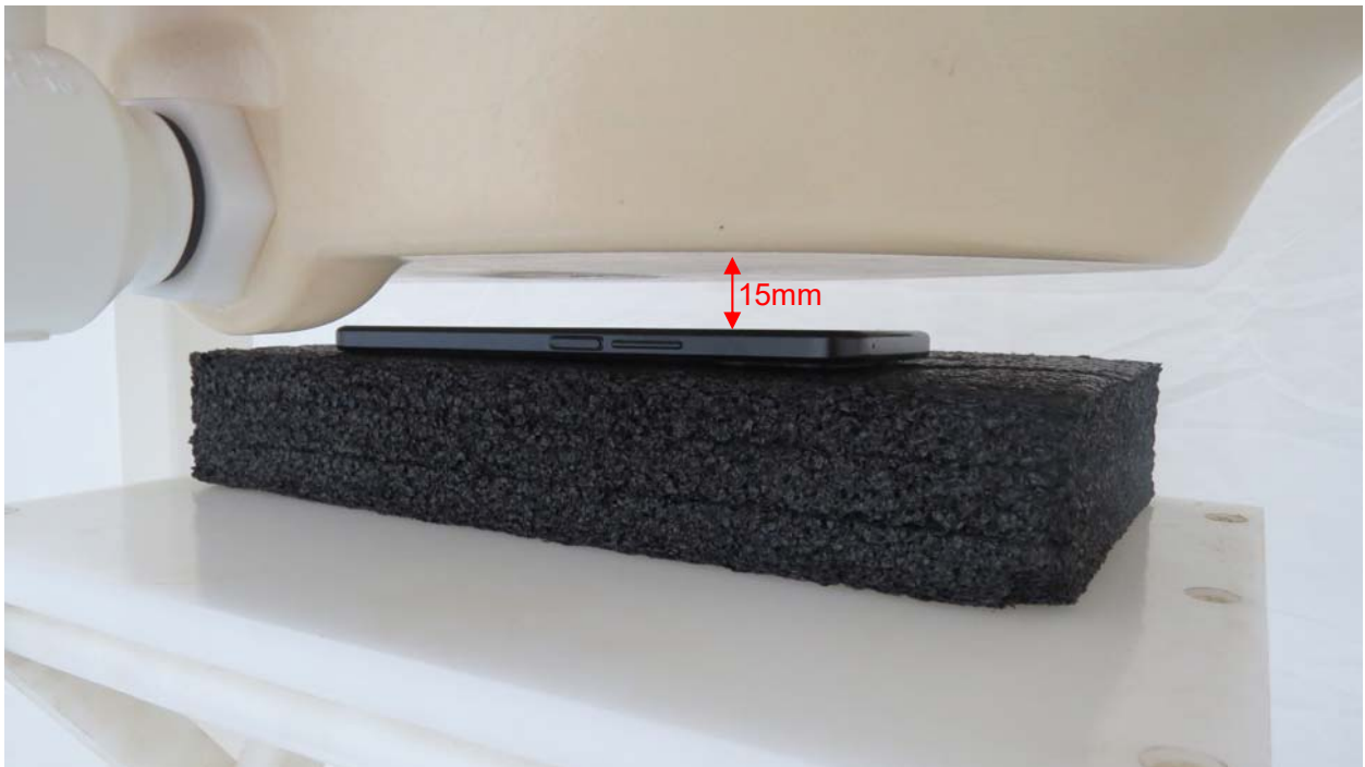
Picture 6: Front Side, the distance from handset to the bottom of the Phantom is 15mm