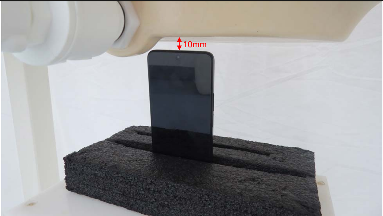
Picture 11: Top Side, the distance from handset to the bottom of the Phantom is 10mm