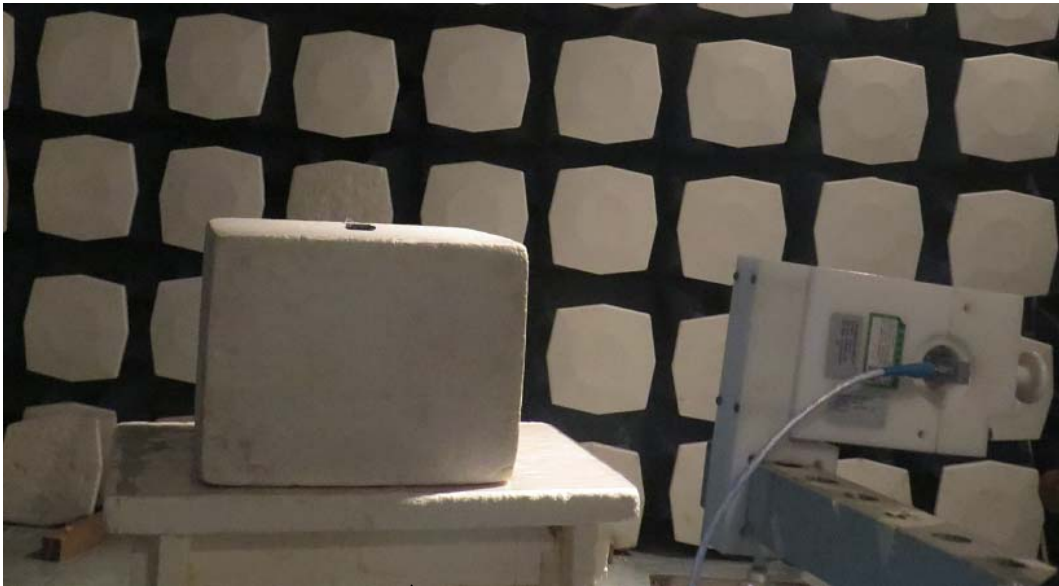
18GHz - 26.5GHz