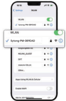
Choose WiFi "Sytong..." to connect WiFi (Password: 12345678 )