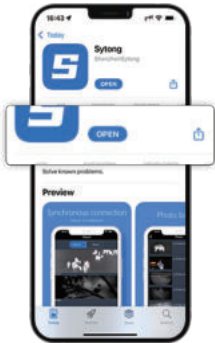
Download the APP

Download APP by Scanning the QR code according to the mobile phone system.