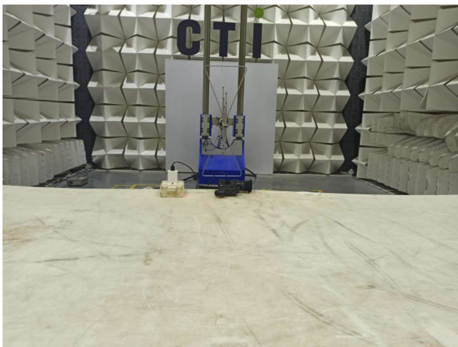
Radiated spurious emission Test Setup-2(Below 1GHz)