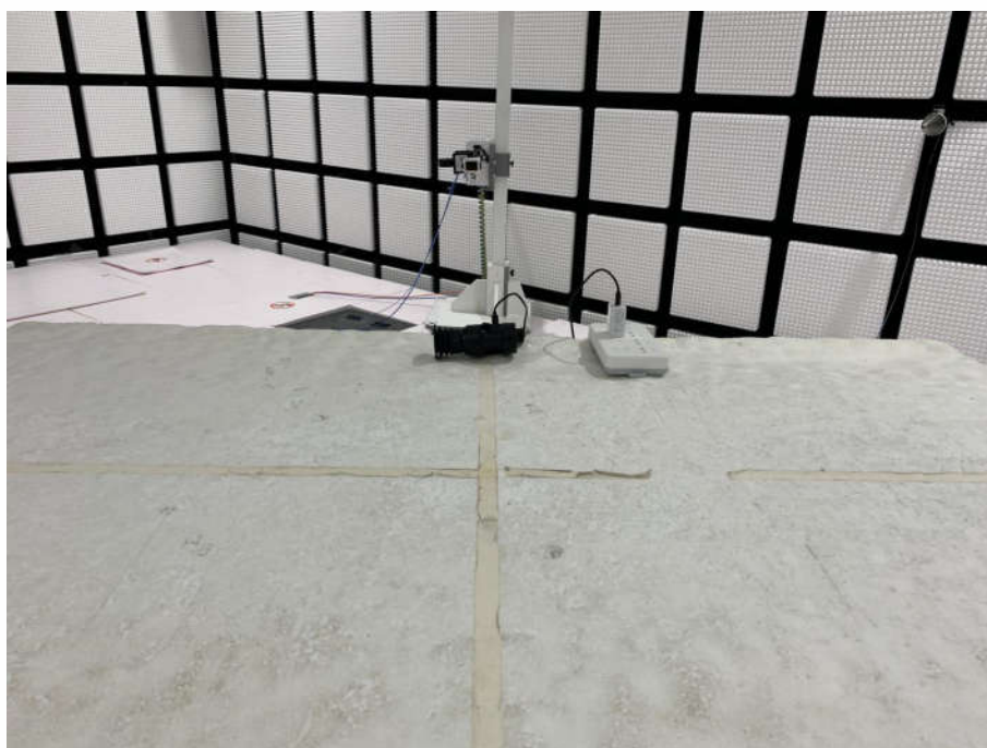
Radiated spurious emission Test Setup-4(Above 18GHz)