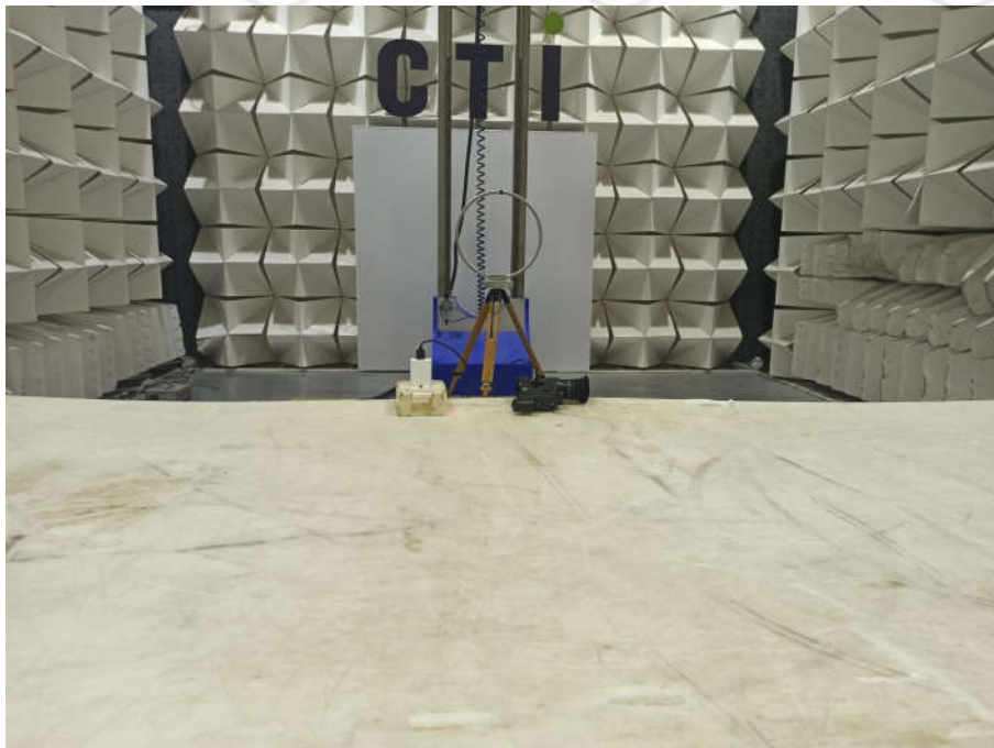
Radiated spurious emission Test Setup-1(Below 30MHz)