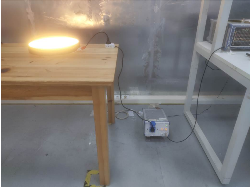
Photo of Power Line Conducted Measurement