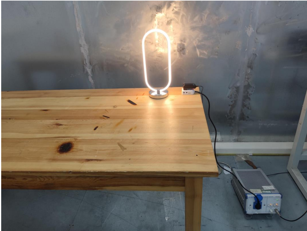
Conducted Emission-AC adapter charge mode