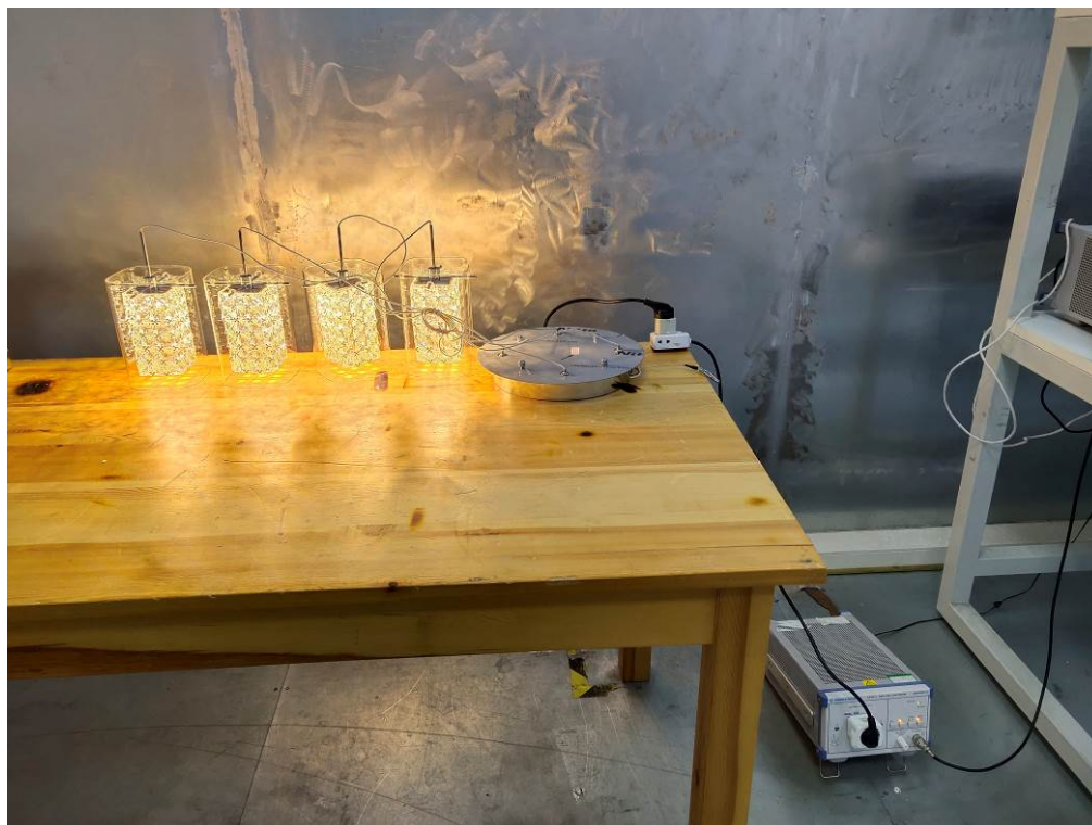
Photo of Power Line Conducted Measurement