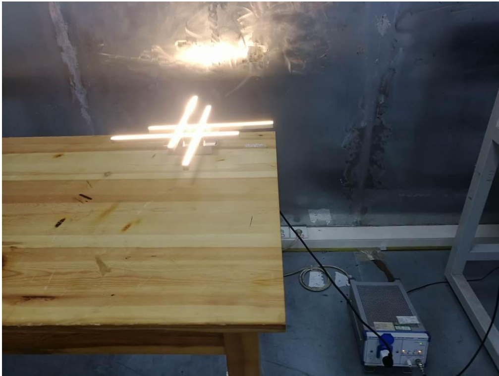
Photo of Power Line Conducted Measurement