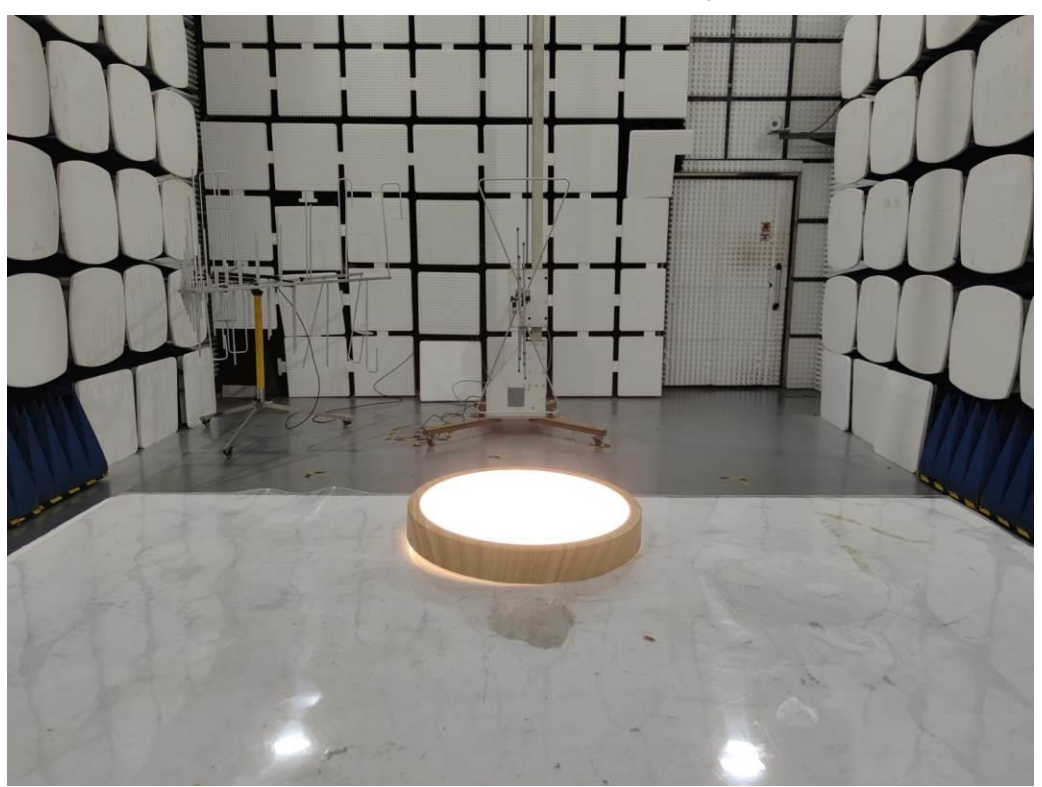
Radiated Emission below 30MHz-AC adapter charge mode

This report shall not be reproduced except in full, without the written approval of Shenzhen LCS Compliance Testing Laboratory Ltd. Page 1 of 1