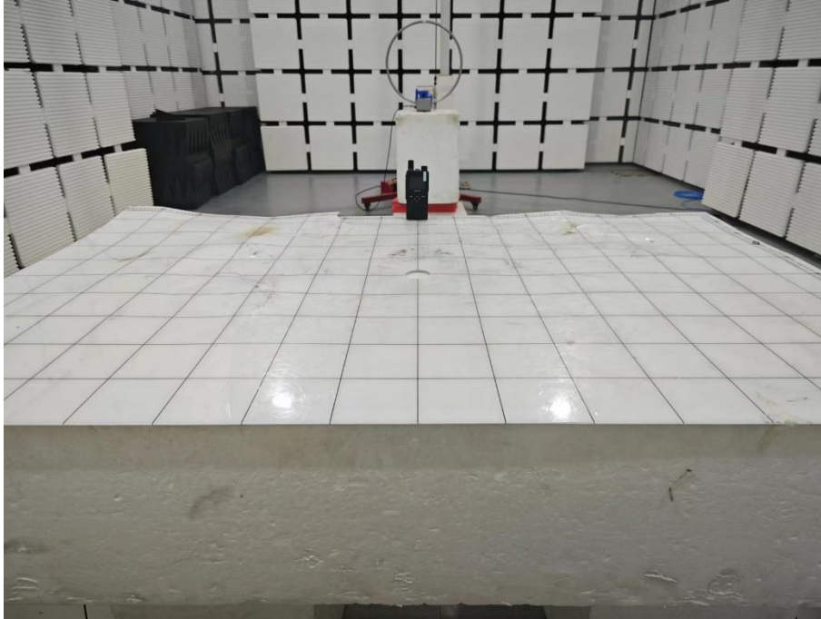
Set-up for Transmitter & Receiver Spurious Emissions, 30MHz to 1000MHz