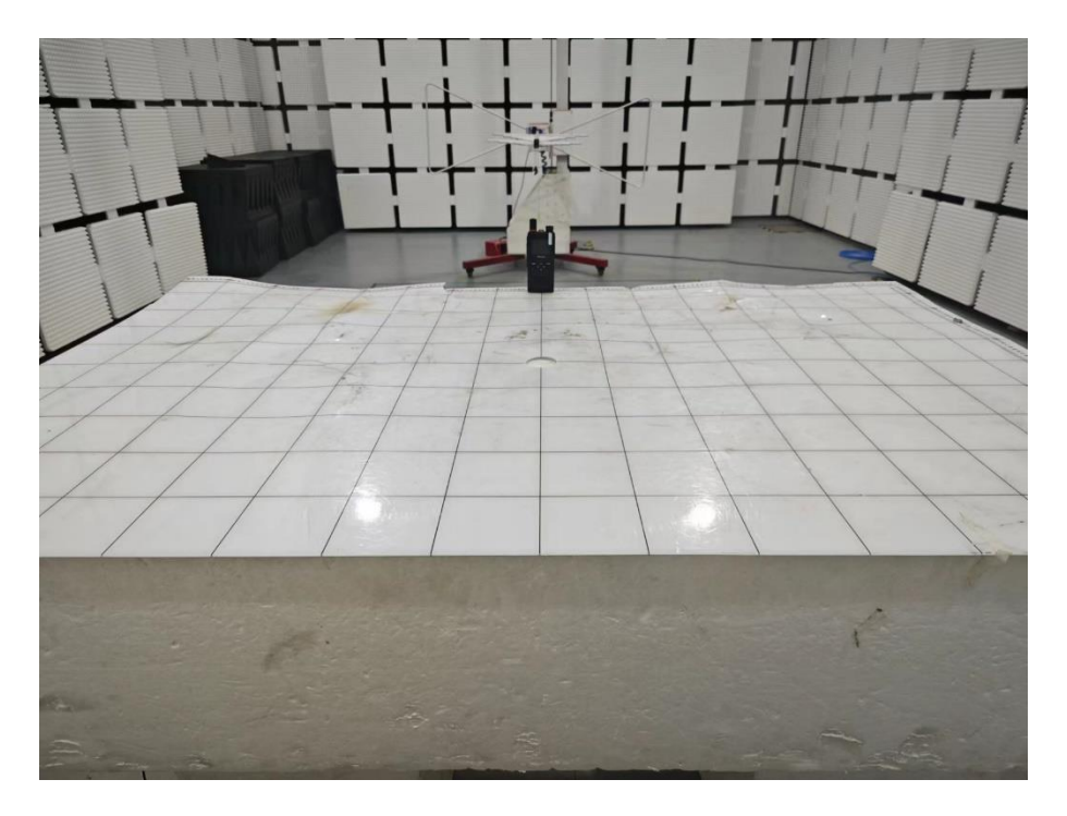
Set-up for Transmitter & Receiver Spurious Emissions, 30MHz to 1000MHz

Set-up for Transmitter & Receiver Spurious Emissions, 9kHz to 30MHz