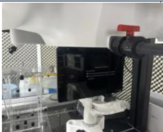
TOP (dist. 0mm)