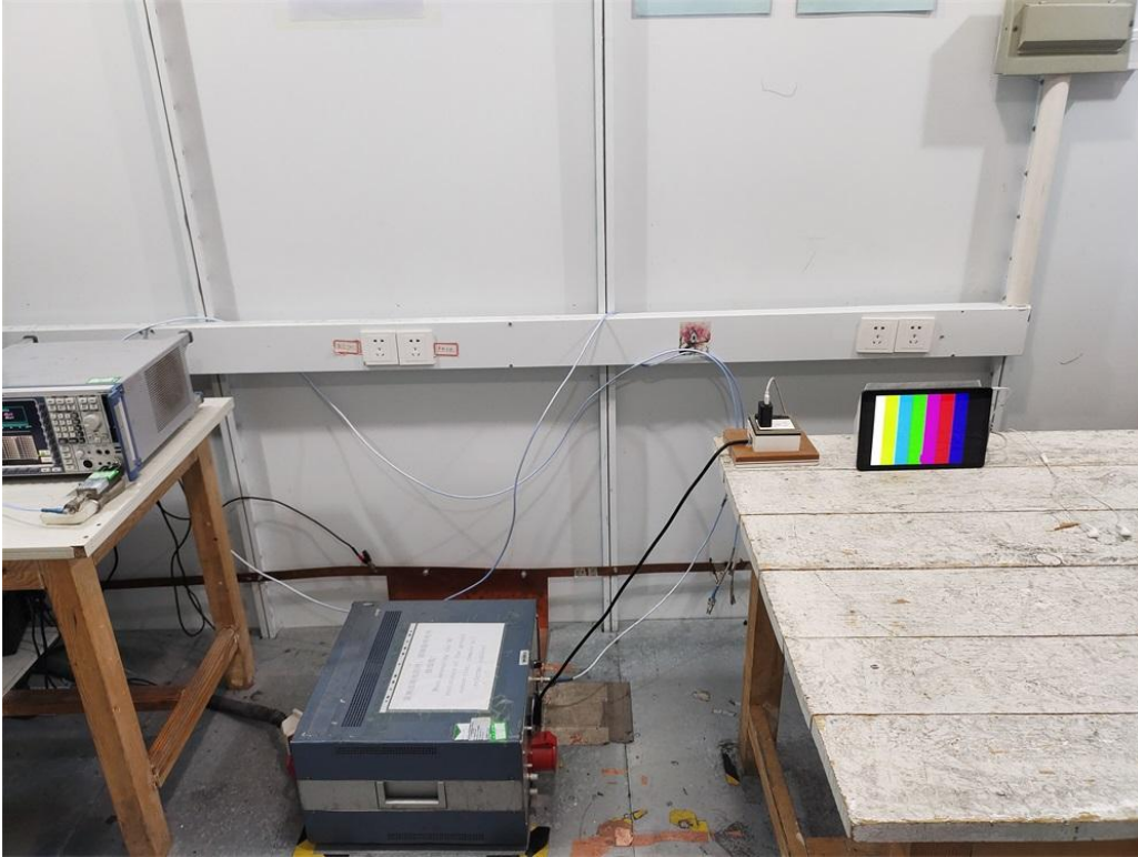
Fig. 3 Photo of DFS