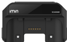
Swift 1 Scanner