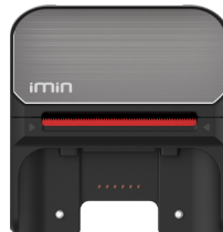
Swift 1 Printer