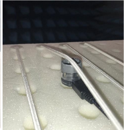
Axis XY on FAR