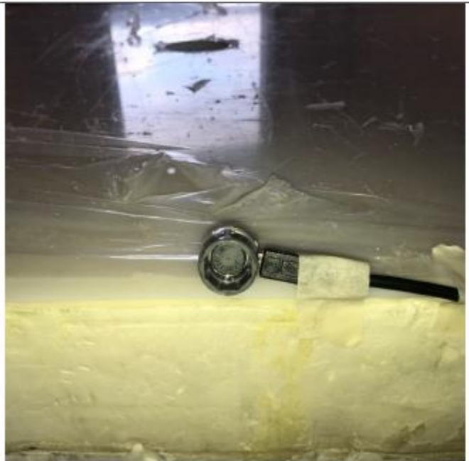
Axis Z on OATS