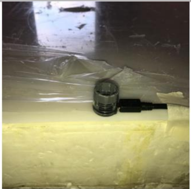
Axis XY on OATS