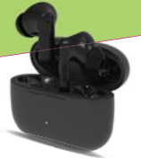
MJ111 quick guide