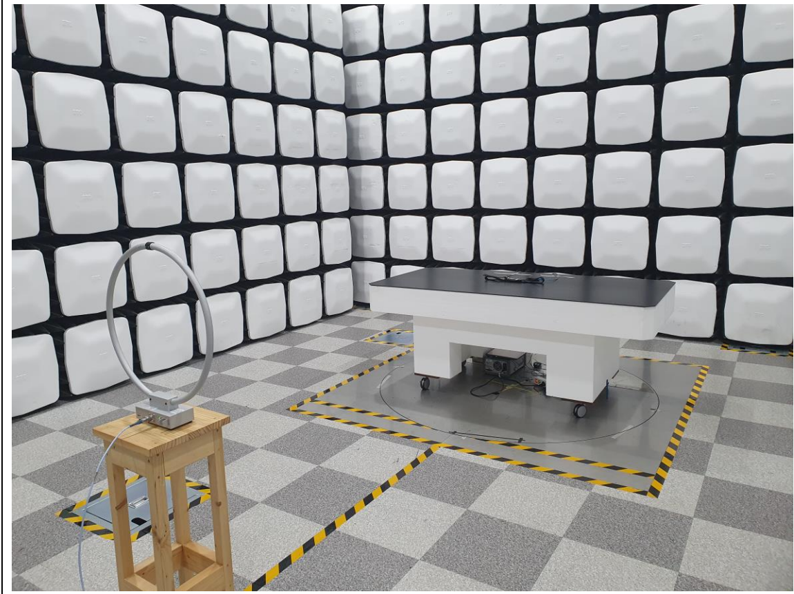
Below 30 MHz