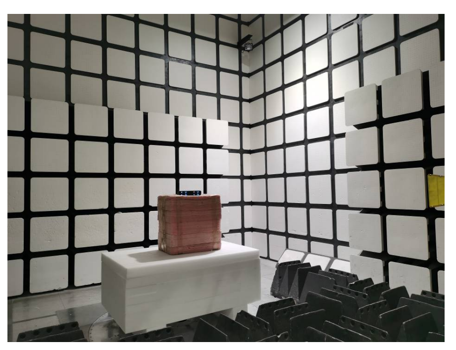
Radiated Emissions View (Above 1 GHz)