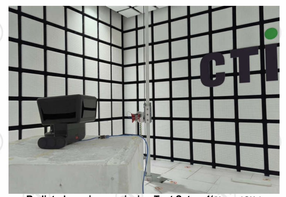
Radiated spurious emission Test Setup-4(Above 1GHz)