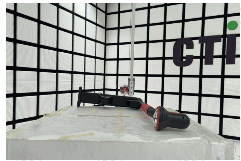
Radiated spurious emission Test Setup-3(Above 1GHz)