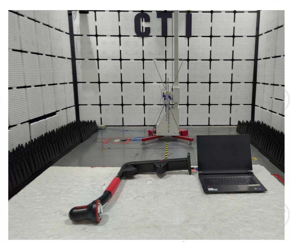
Radiated spurious emission Test Setup-1(Below 1GHz)