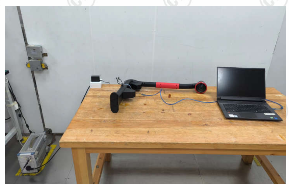
Conducted Emissions Test Setup-1