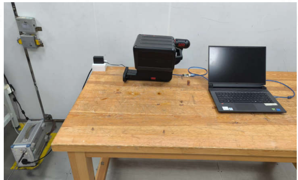
Conducted Emissions Test Setup-2