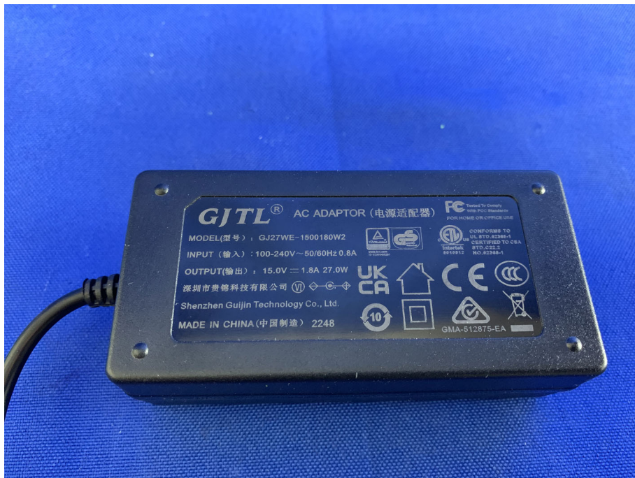
View of Product-26