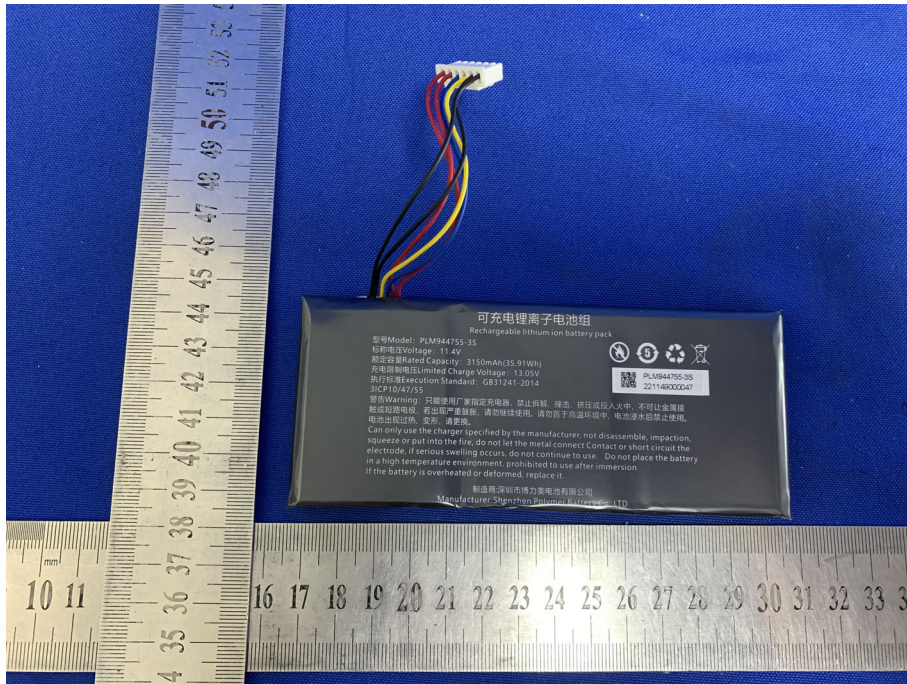
View of Product-23