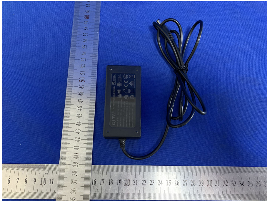
View of Product-25